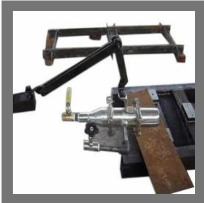
Die Heating Burner