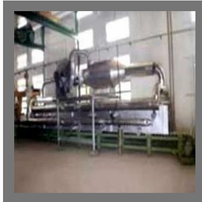
Gas Fired Oven