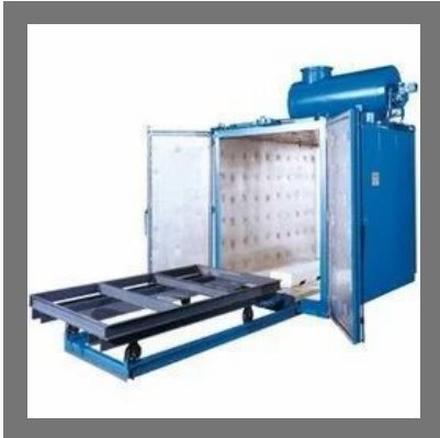
Batch Type Oven