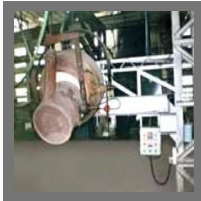
Ladle Preheating System