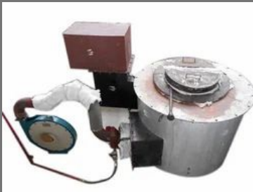
Copper Melting Furnace