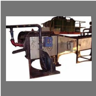
Billet Heating Equipments