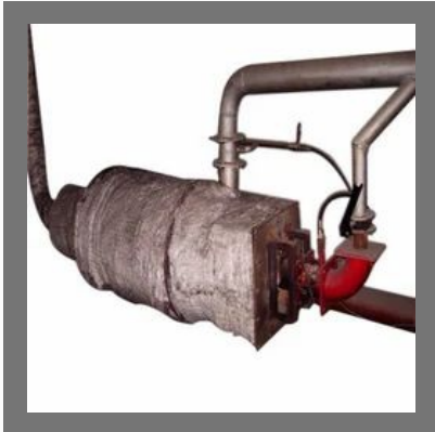
Hot Air Generating System