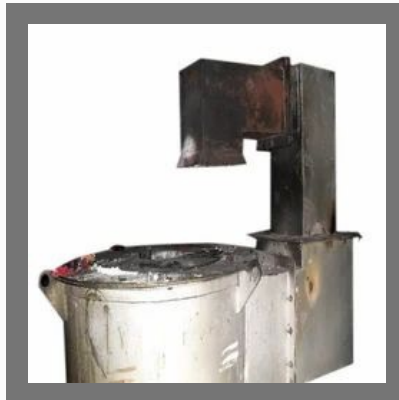
Heat Recovery System