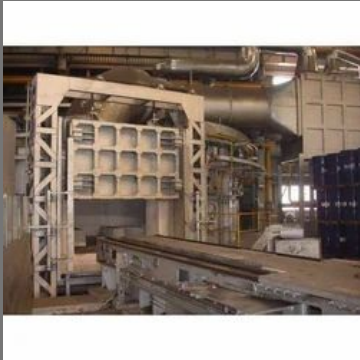
Conveyor Heat Treatment Furnaces