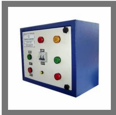
Auto Ignite Flame Sensor