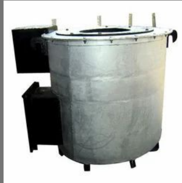
Non Ferrous Melting Furnace