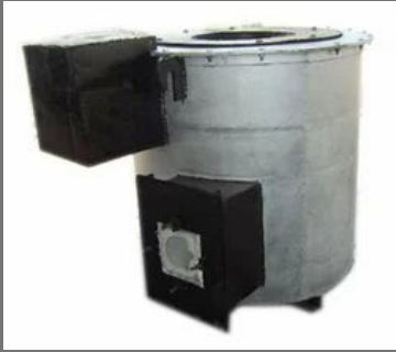
Curable Melting Furnaces