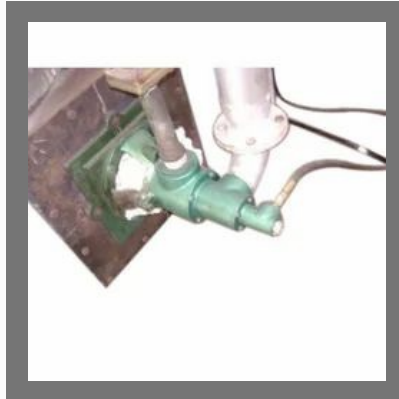
Dual Fuel Burners