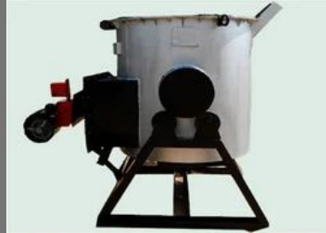
Bulk Melting cum Tilting Furnaces