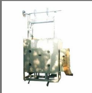
Ferrous Melting Furnace