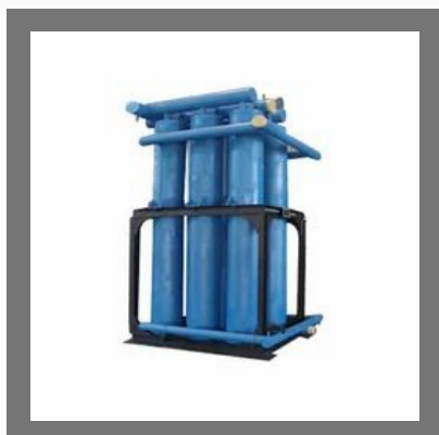
Heat Exchanger Assembly