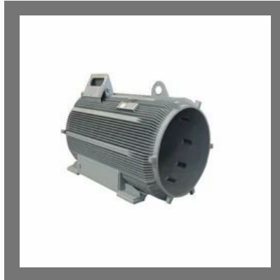
Fabricated Motor Frames