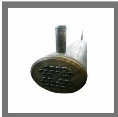
U- Tube Heat Exchangers