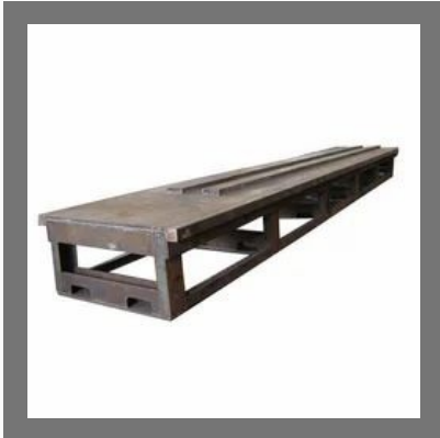
Heavy Engineering Equipment