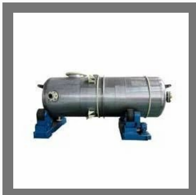
Steam & Water Drums