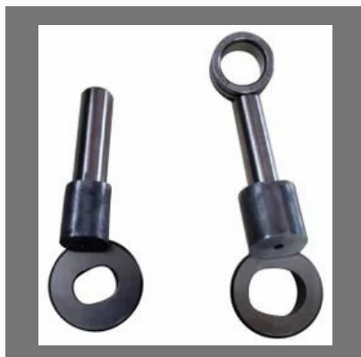
Profile Punch Die