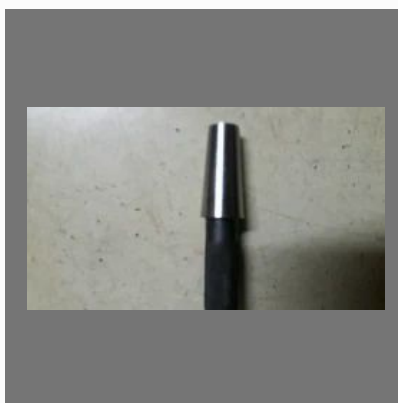
Taper Plug Gauge