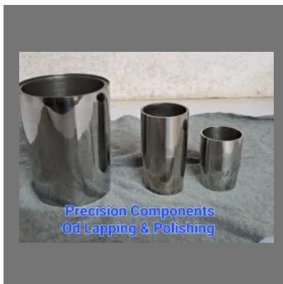
Precision components Od Lapping Polishing