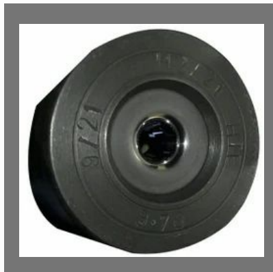
Wire Drawing Die Polishing