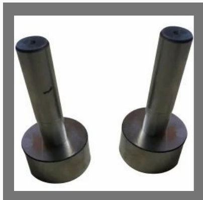
Piercing Punch Bush in transformer lamination