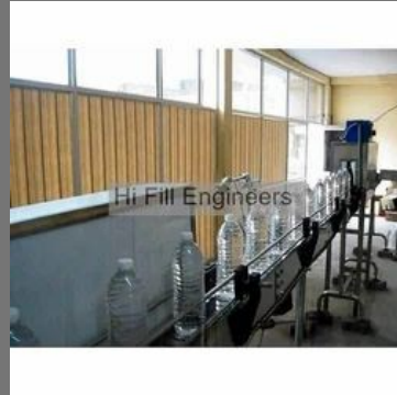
Slat Chain Conveyor System