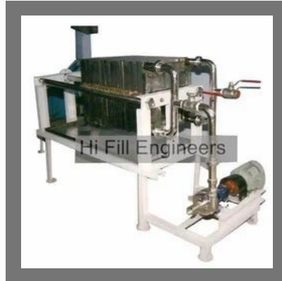
Automatic Filter Press