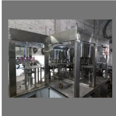
Packaged Drinking Water Machine