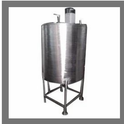
Stainless Steel 304 Mixing Tank