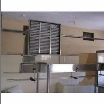
Air Conveyor Systems