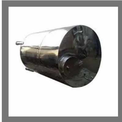
Stainless Steel 316 Storage Tank