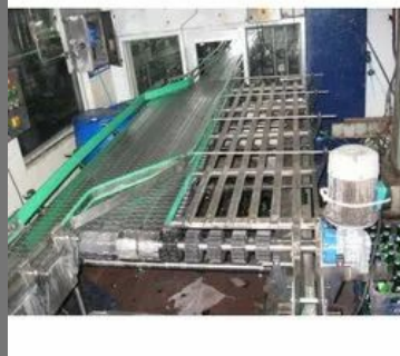
Bottle Conveyor system