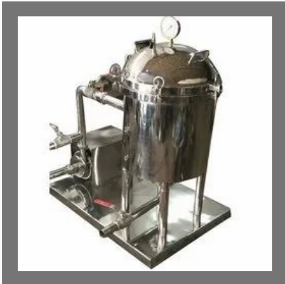
Sparkler Filter Press