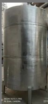
Stainless Steel Blending Storage Tank