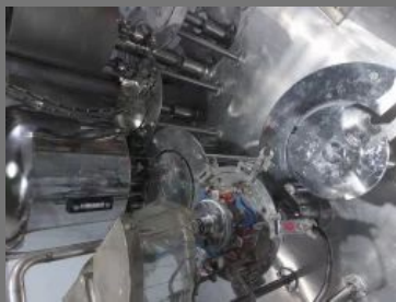
Mineral Water Packing Machine