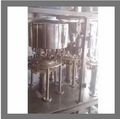
Water Filling Machine