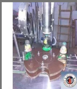
Crown Capping Machine