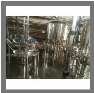
60 BPM Water Filling Machine