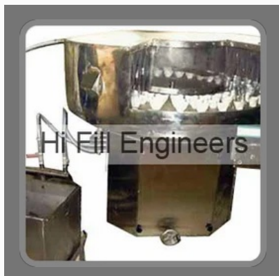
Rotary Bottle Rinser