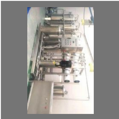
SS RO Plant