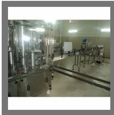
Mineral Water Bottling Plant