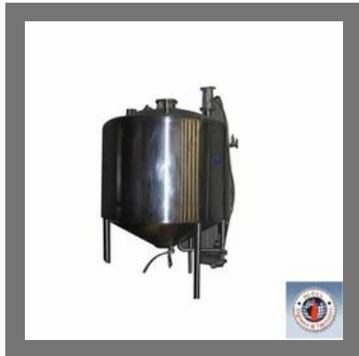
SS Bottling Machinery