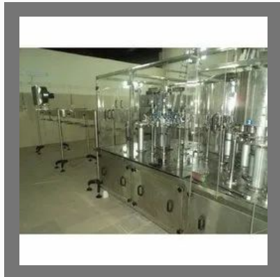
Drinking Water Bottling Plant