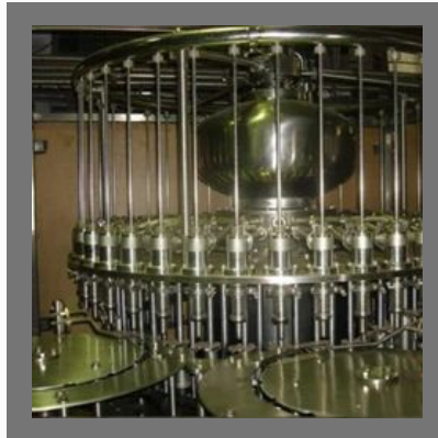
Water Packaging Machine