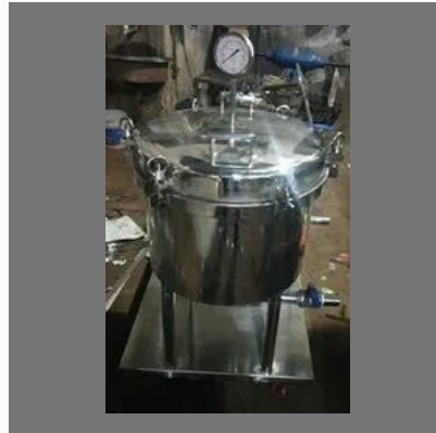
Sparkler Filter Press Machine