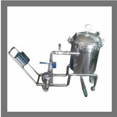
Stainless Steel Sparkler Filter Press