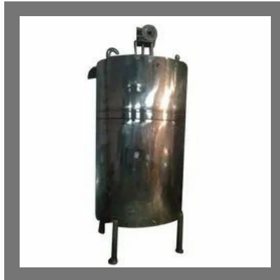
Vertical Stainless Steel Storage Tank