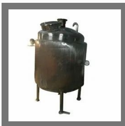
Steam Jacketed Kettle