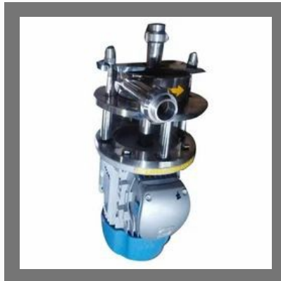
Horizontal Centrifugal Pump