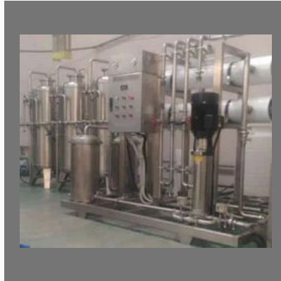
Industrial RO System