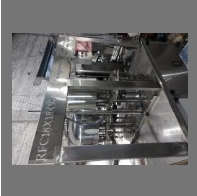
Water Plant Machinery