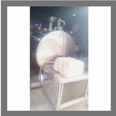
Bulk Milk Cooler