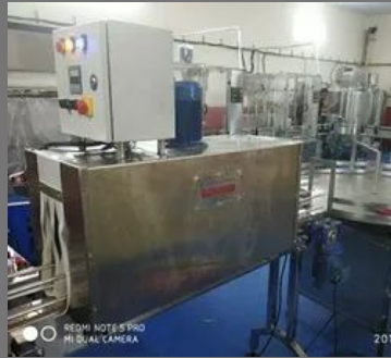
Shrink Tunnel Machine