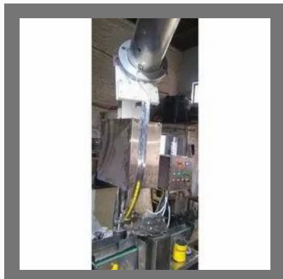
Automatic Screw Capping Machine