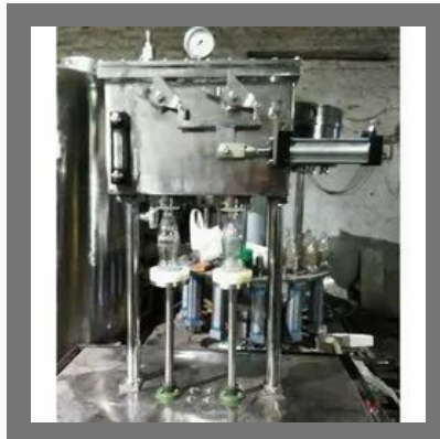
Soda Filling Machine