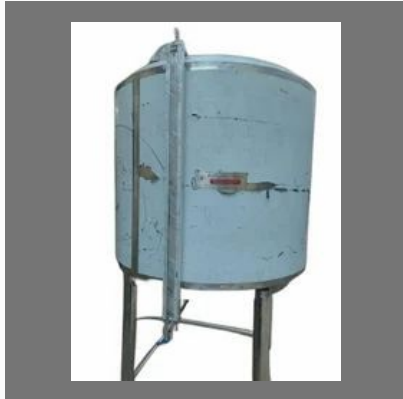
Stainless Steel Sugar Tank