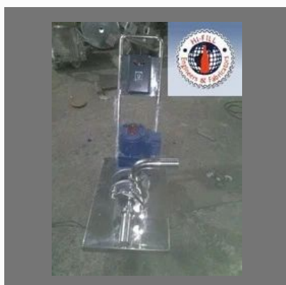
High Pressure Multistage Centrifugal Pump