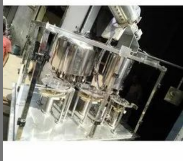
Bottle Filling Machine