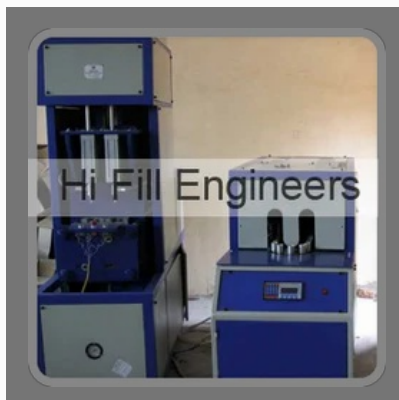
Pet Blowing Machine