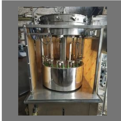
Cold Drink Filling Machine