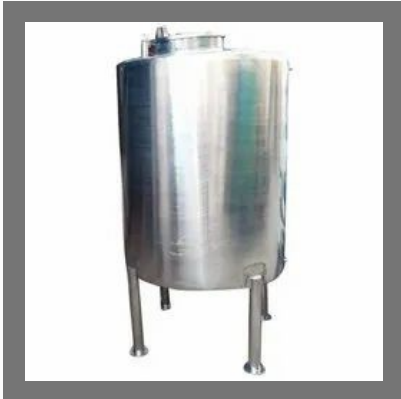
Sanitizer Mixing Tank