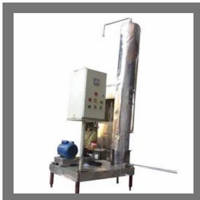
Stainless Steel Carbonator