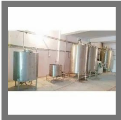
Stainless Steel Tank