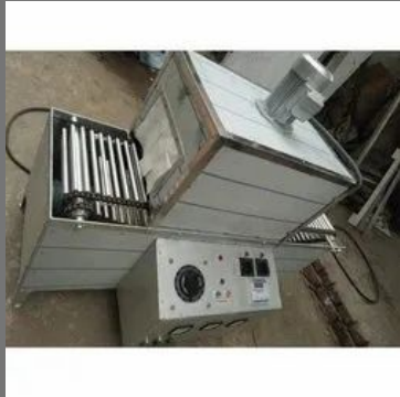
Shrink Wrapping Machine