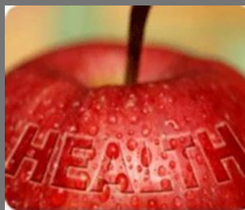
Health Insurance Plans