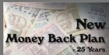
New Money Back Plan 25 Years