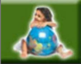
Education And Marriage Planning Service