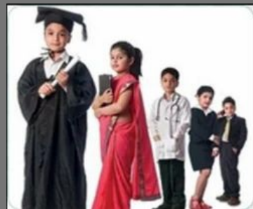
Child Protection Plans