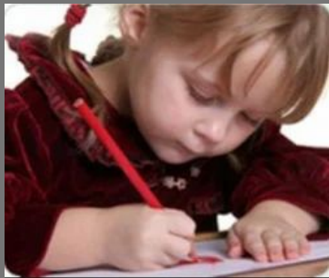
Pure Protection Plan