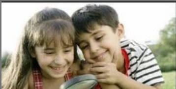
Child Plans Service