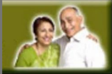
Retirement Pension Planning Service