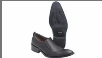
Men Shoes (Kangi)