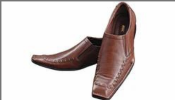
Men Shoes (Goldy)