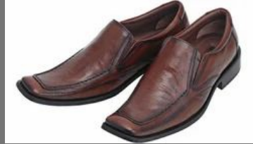
Men Shoes (Churchill)