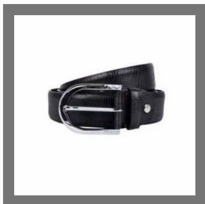
BS305 Brown Leather Belt