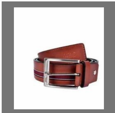
BS030 Tan Leather Belt