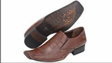
Men Shoes (Brutni)