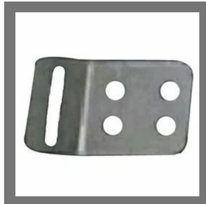
Rack Mount Bracket