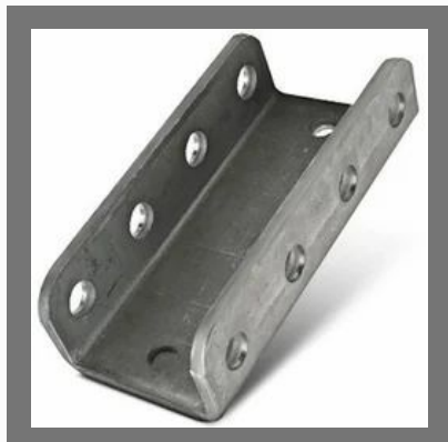
Adjustable Mount Bracket