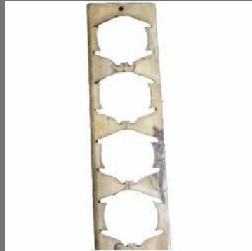
CNC Wire EDM Job Work