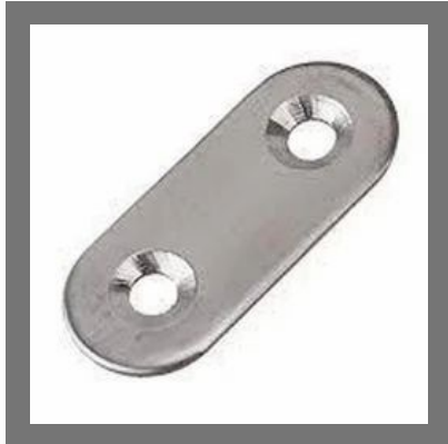
Flat Steel Bracket