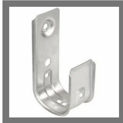
Metal J Hook