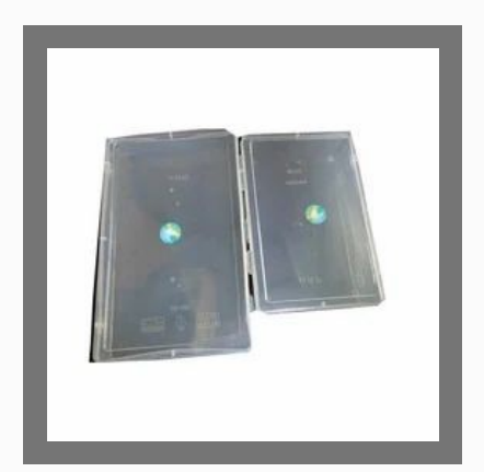
Plastic Keeper Boxes