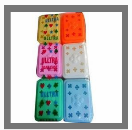
Plastic Soap Case