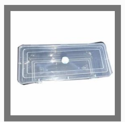
Plastic Bangle Boxes