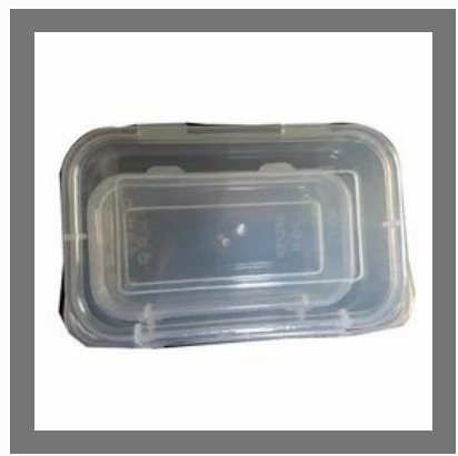
Transparent Keeper Boxes