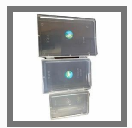
Plastic Jewellery Boxes