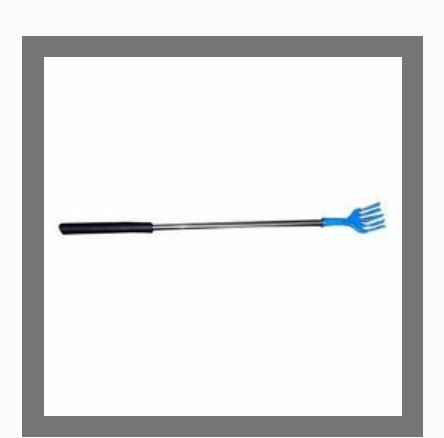
Plastic Itching Sticks