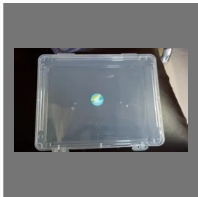
Plastic Mithai Boxes