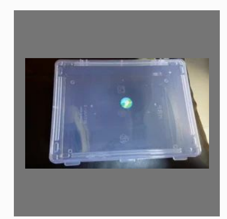
Plastic Mithai Boxes