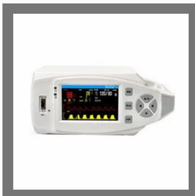
Tabletop Pulse Oximeter