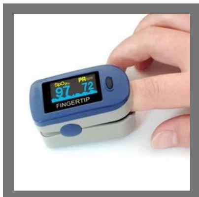
Finger Tip Pulse Oximeter