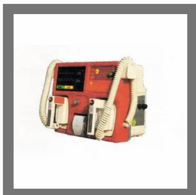
Multipara Biphasic Defibrillator