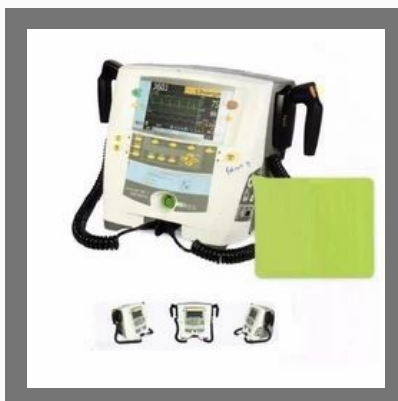
Manual External Defibrillator