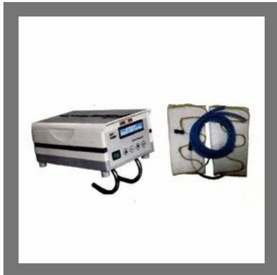
DVT Prevention Foot Pump