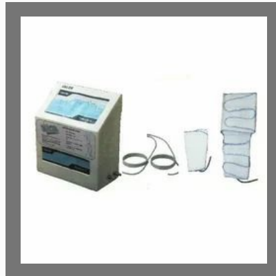
Deep Vein Thrombosis Pump