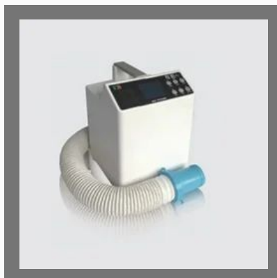
Fully Mobile Patient Warming System