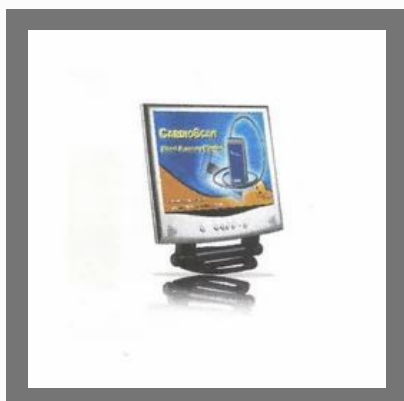
Blood Pressure Monitor