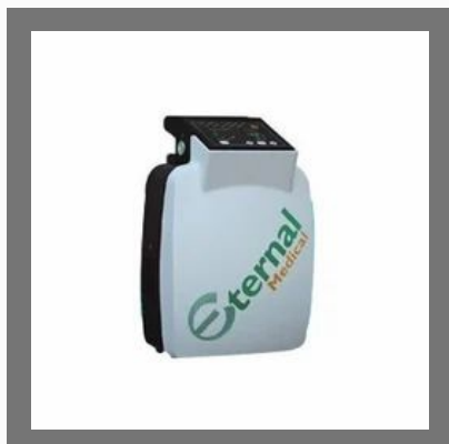
Patient Warming System