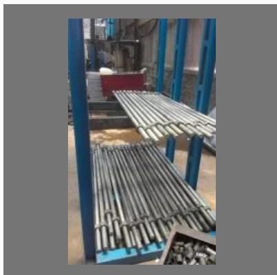
Hot Dip Galvanizing Anchor Rods