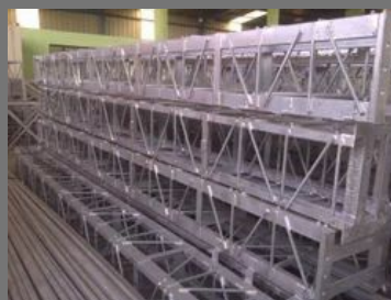
Hot Dip Galvanized Steel Structures