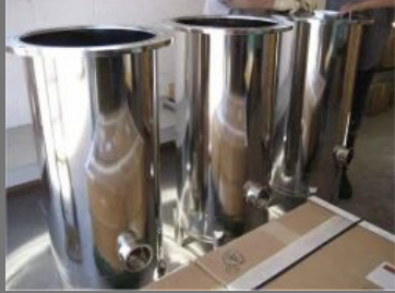
Stainless Steel Electroplating Service