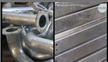
Hot Dip Galvanizing Services for Strut Channels