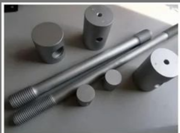
Zinc Flake Coating Services