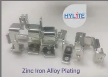
Zinc Iron Plating