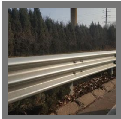
Mild Steel Hot Dip Galvanizing Services