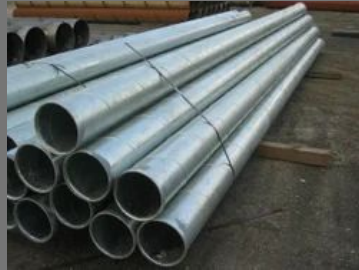
Hot Dip Galvanizing Pipe