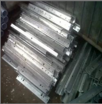
Hot Dip Galvanizing