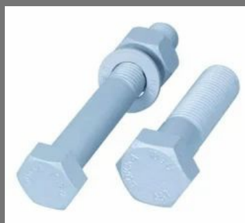
Zinc Flake Coating