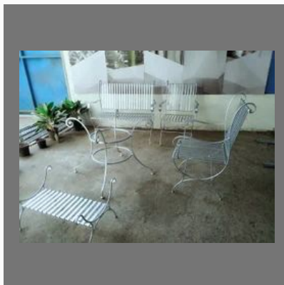
Galvanizing Services for Wrought Iron Furniture