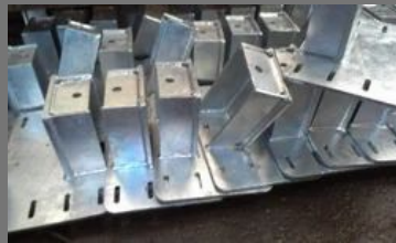
Hot Dip Galvanizing Of MS Brackets