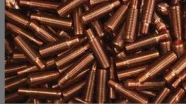
Copper Plating Services