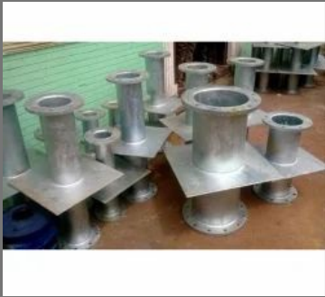
Hot Dip Galvanizing service