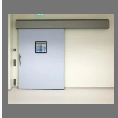
Operation Theater Doors