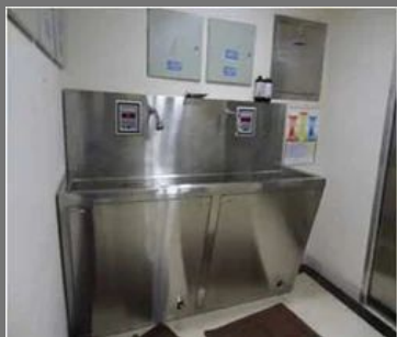
Surgical Scrub Sink