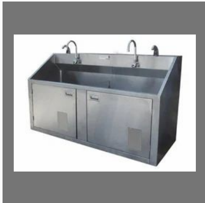
Hospital Scrub Sink