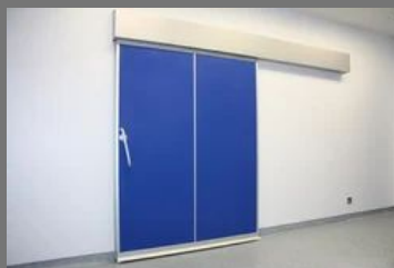
Hermetically Sealed Sliding Door