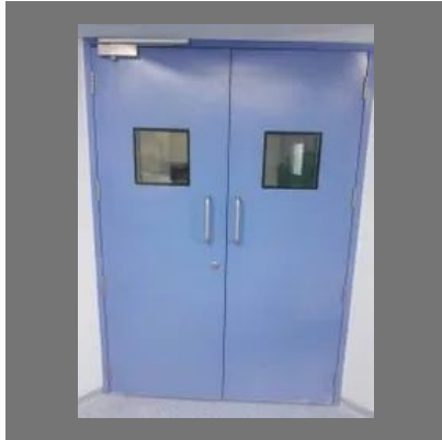
Powder Coated door