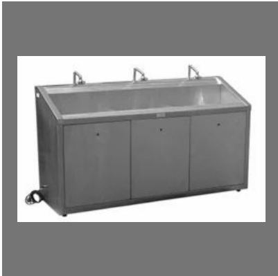
Surgical Scrub Stations