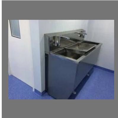
Surgical Scrub Station 2 Bay