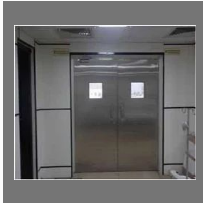
Hermetically Sealed Stainless Steel Swing Door