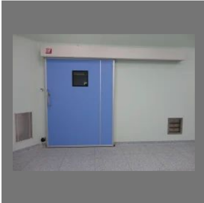
Hermetically Sealed Sliding Door