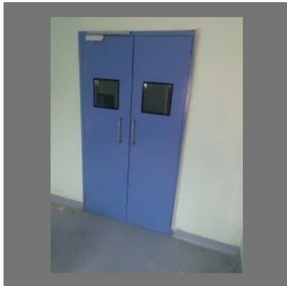
Lead Lined Door