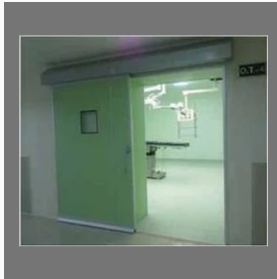
Hermetically Sealed Sliding Doors