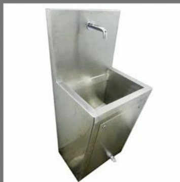
Single Surgical Scrub Sink