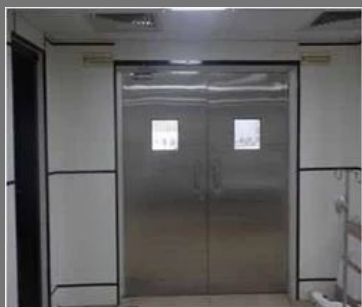
Hermetically Sealed Double Door