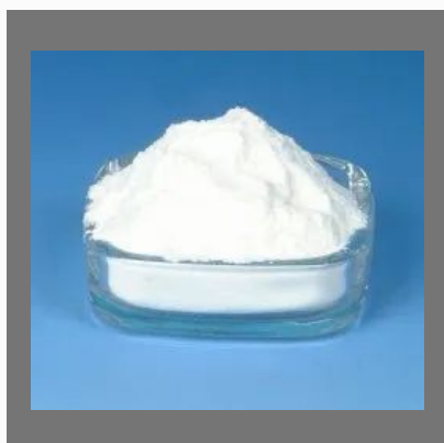
20% Chitosan Oligosaccharide Solution