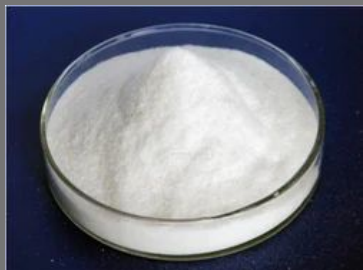
Chitosan HBD DA Above 90%