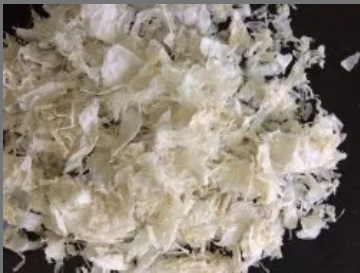
Chitin Powder For Animal Feed