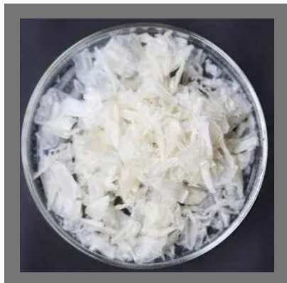
Glucosamine Conversion Raw Material