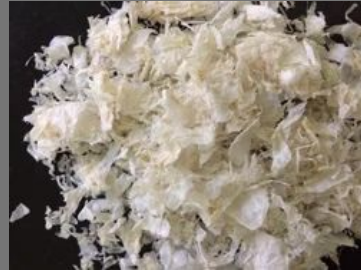
N-Acetylglucosamine Conversion Raw Material