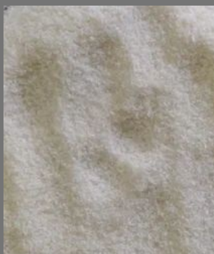
Chitosan HBD packaging