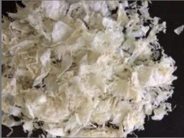
Chitin Ash Below .5%