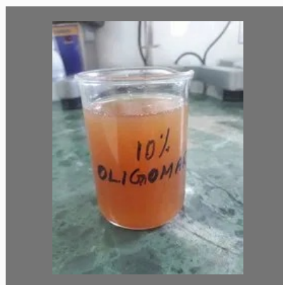
10% Chitosan Oligosaccharide Solution