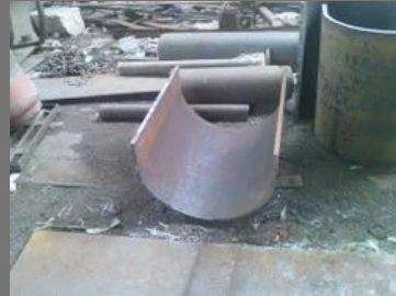
Sheet Bending Service