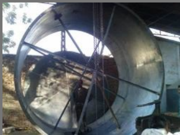
Large Dia Drum Bending