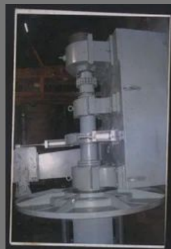
Automatic Coiler Machine