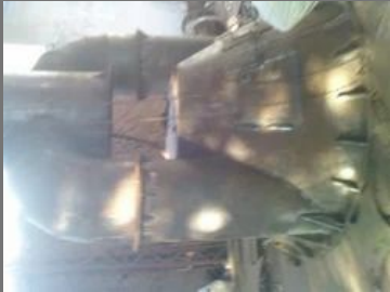
Chimney Fabrication Work