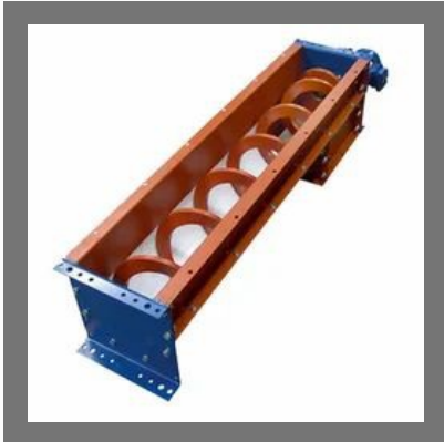
Shaftless Screw Conveyors