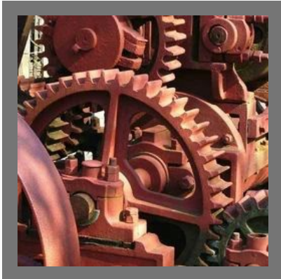
Rock Crusher Gears