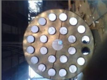
Cone Bending Service