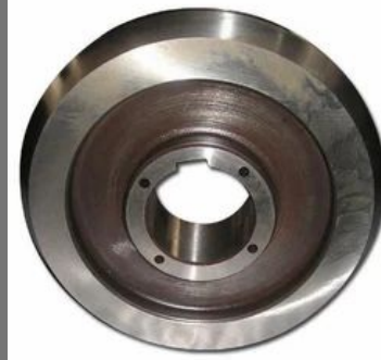
Rolling Mill Stands