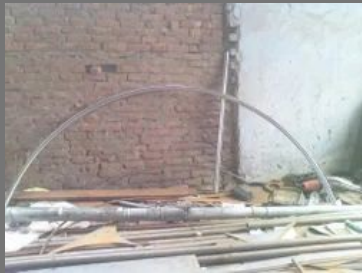
Pipe Bending Service