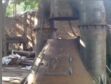
Chimney Fabrication Service