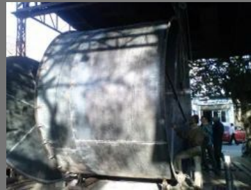
Drum Bending Service