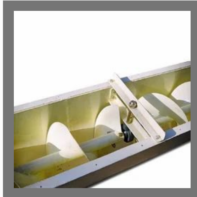
Screw Conveyor System