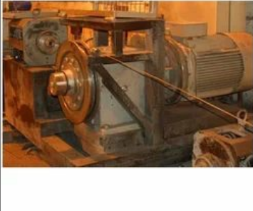
Wire Rolling Mills