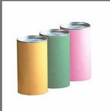
Paper Composite Container