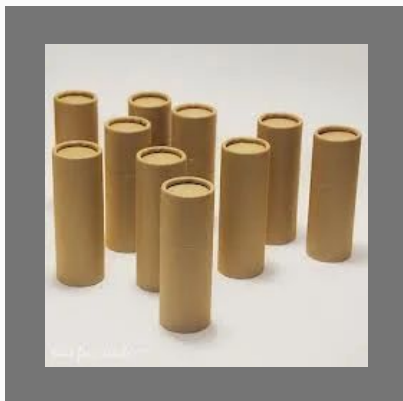
Kraft Paper Tubes