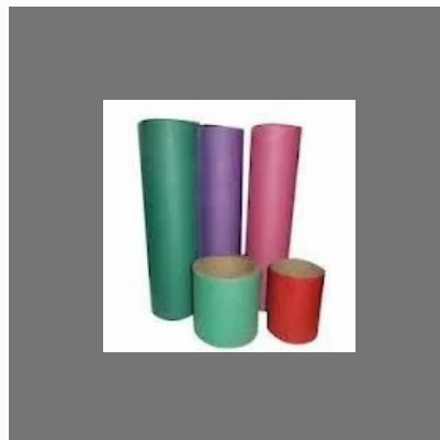
Packaging Paper Tubes