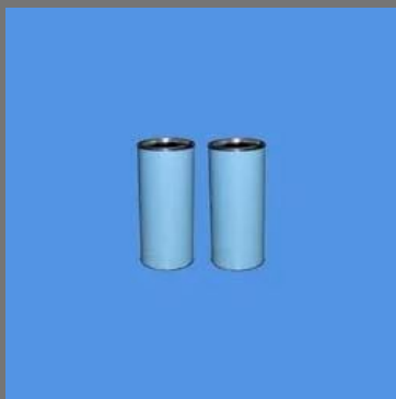
Industrial Composite Container