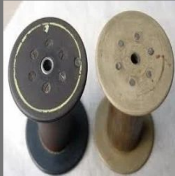
Thread Paper Bobbin