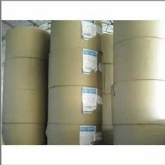
Paper Cup Bobbin