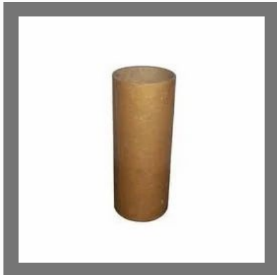
Paper Core Tubes