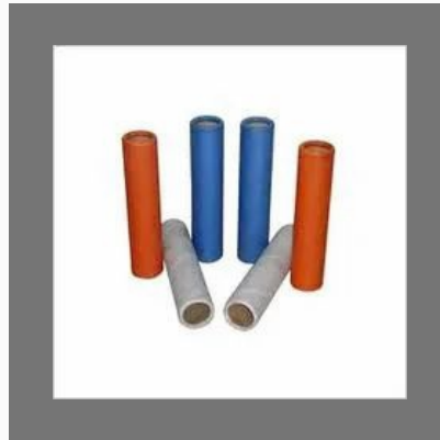
Spiral Paper Tubes