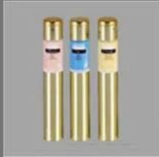
Decorative Composite Container