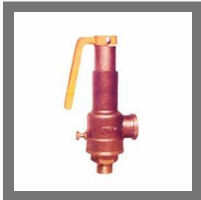
Spring Loaded Safety Relief Valve