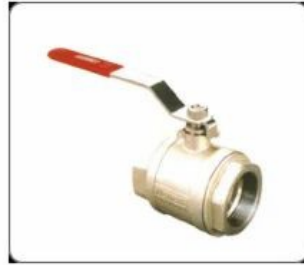
One Piece Design Full Port Screwed End 150 / 300 Lbs Rating Ball Valve