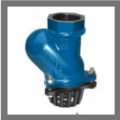
Normex Ball Foot Valve (Threaded)