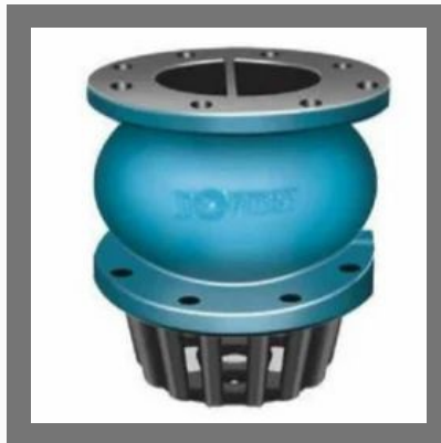
Normex Silent Foot Valve