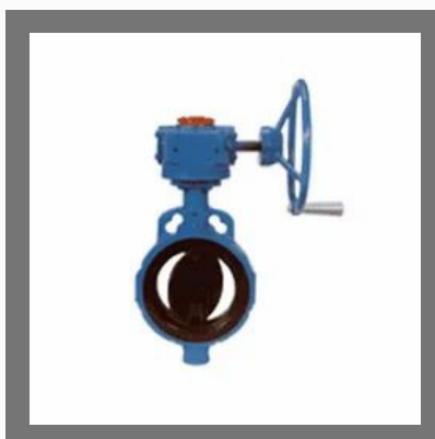
Slimseal Butterfly Valve