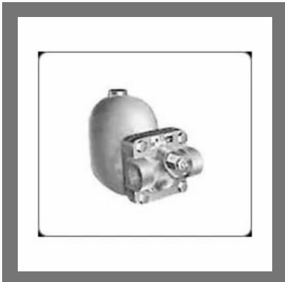
Ball Steam Traps