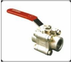
Three Piece Design Full Port Screwed