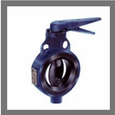
Aquaseal Butterfly Valve