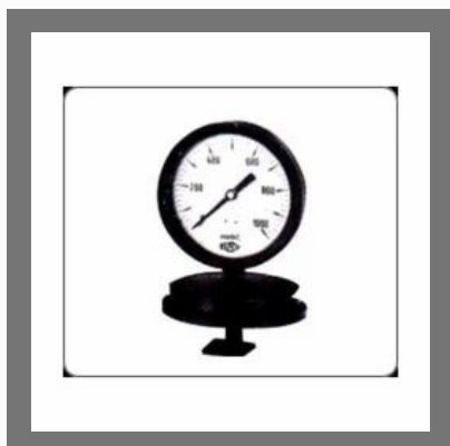
Low Pressure Capsule Type Gauges