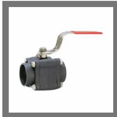
Reduced Bore Ball Valves (Three-Piece Design)