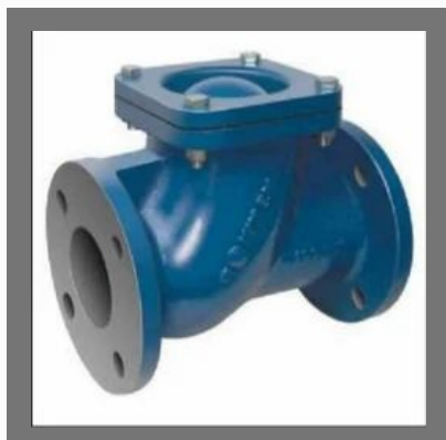
Normex Ball Check Valve (Flanged)