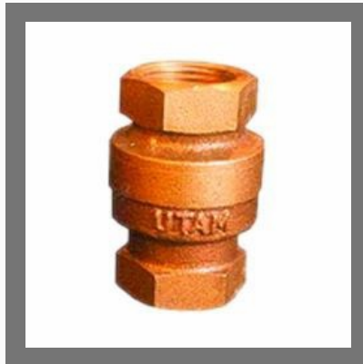
Vertical Check Valve