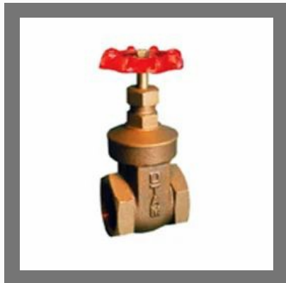
Gate Valve Pegular Type - UV-86-W