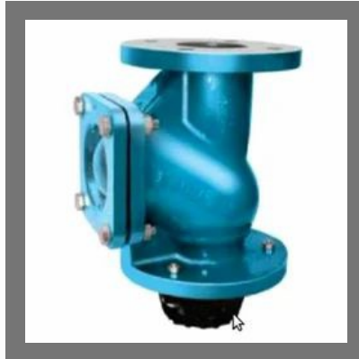
Normex Ball Foot Valve (Flanged)