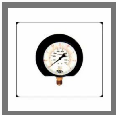
General Purpose Gauges