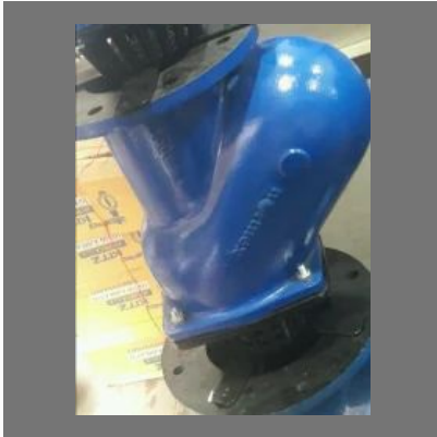
Ball Check Valves