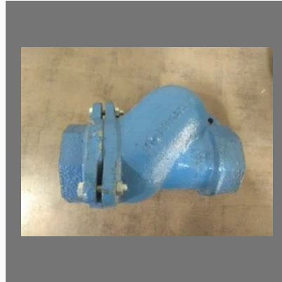
Ball Check Valve