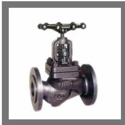
Globe Steam Stop Valve