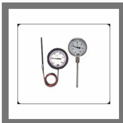
Mercury In Steel Type Thermometer