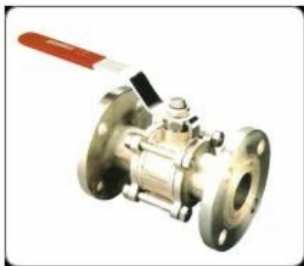
Three Piece Design Full Port Flanged End Ball Valves