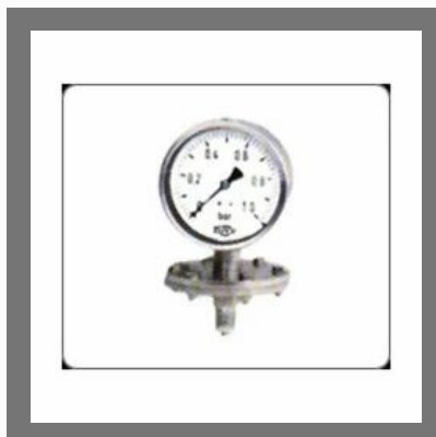
Diaphragm Type Gauges