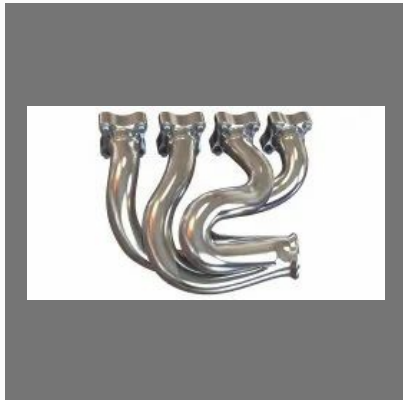
Exhaust Manifold Pattern