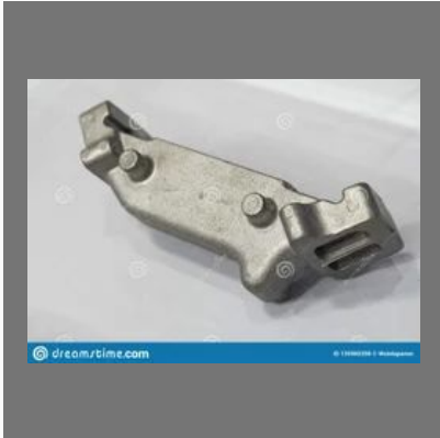
Aluminium Die Casting