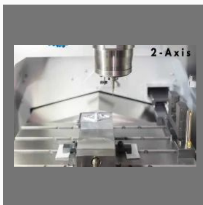
CNC Machine Turning Job Work Services