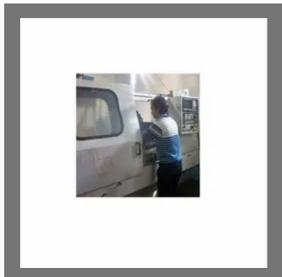
3 Axis CNC Machine Work