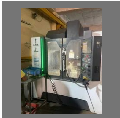
VMC Machine Job Work