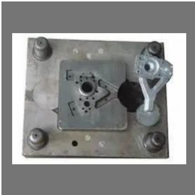
Pressure Die Casting Dies