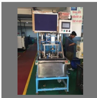
Leak Testing Machine