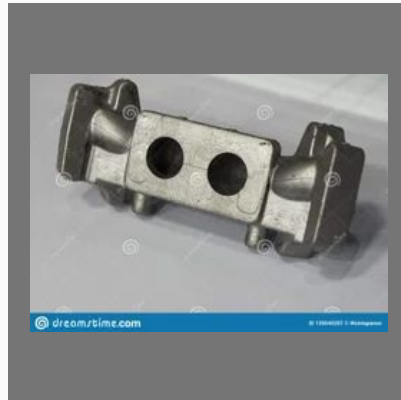
Gravity Die Casting