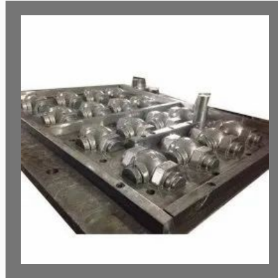
Shell Moulding Pattern