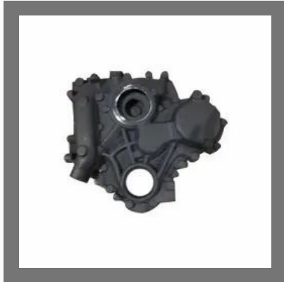
Shell Machine Molding Pattern