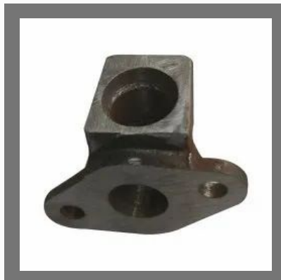
Cast Iron Inlet Flange