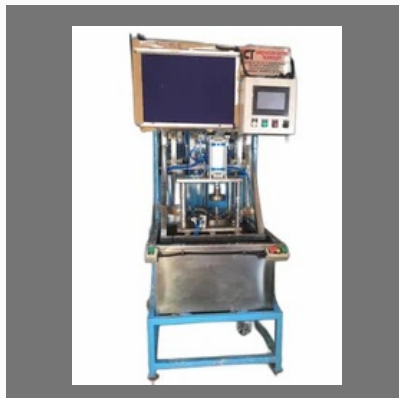
Air Leak Testing Machine