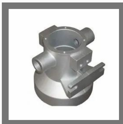
Aluminium Gravity Die Castings Pattern