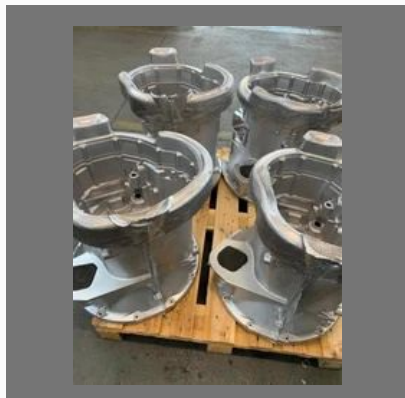
Aluminium Gravity Die Castings