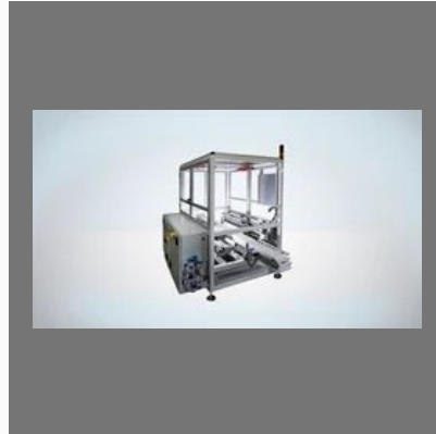
Leakage Testing Machine