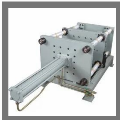
Gravity Die Casting Machines