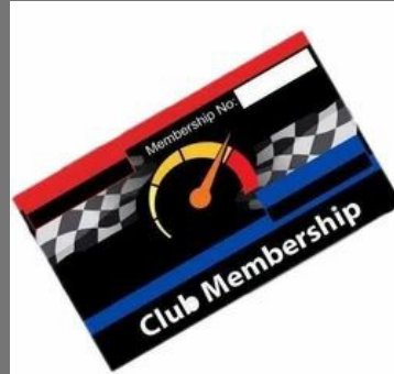
Club Membership Card