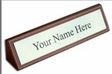
Leather Name Plate