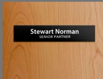
Door Name Plate