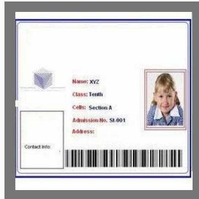
School Id Card