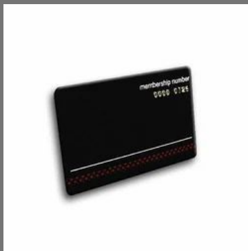
Plastic Membership Card