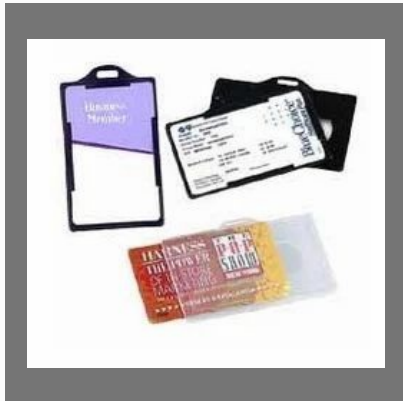
Corporate ID Card