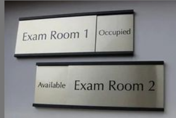
Sliding Name Plate