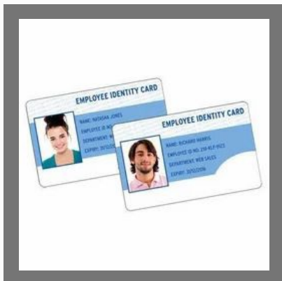
Plastic ID Card