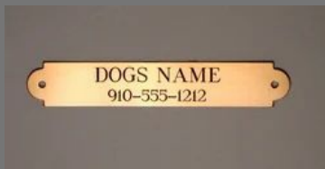
Brass Name Plate