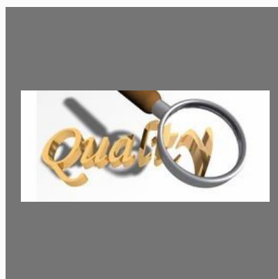
ISO Quality Management System