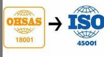
ISO 45001:2018 Certification