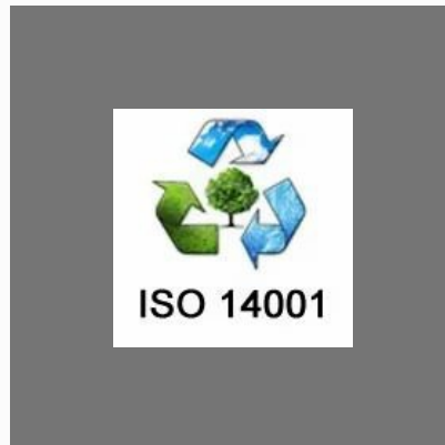
ISO 140012015 Certification