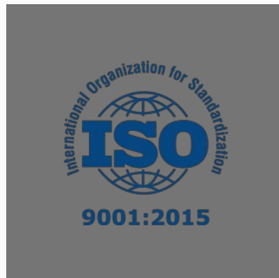
ISO 9001 Certification