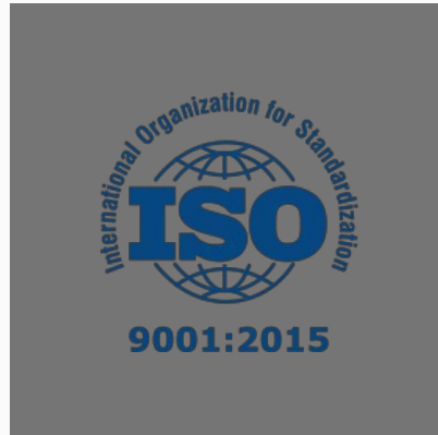
ISO 9001 Certification