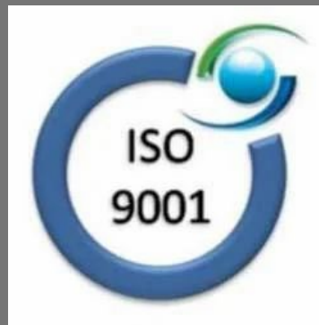
ISO 9001 Certification