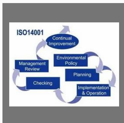
Iso 14001 Environmental Management System