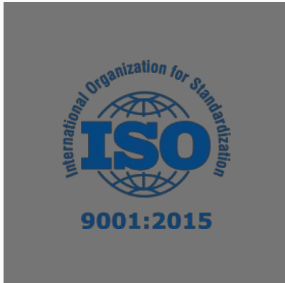
ISO 9001 2015 Certification