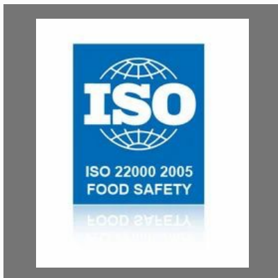
ISO 22000 Certification