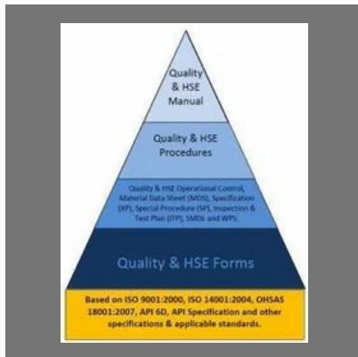
Iso Quality Certification