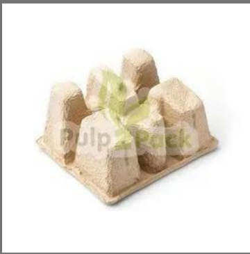
Pulp Molded Fan Packaging Tray