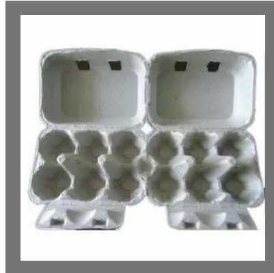
Pulp Egg Storage Box