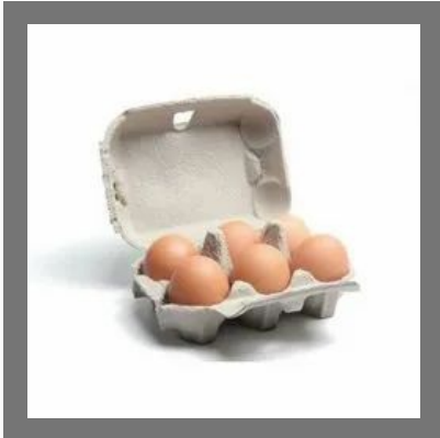
Six Egg Storage Box