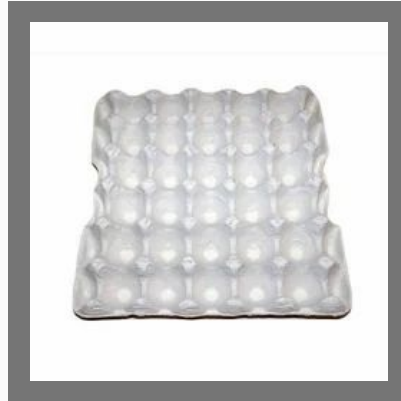
Pulp Egg Filler Tray