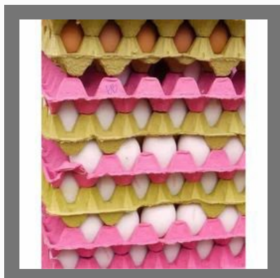
Pulp Egg Tray