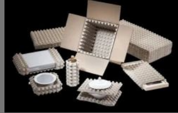
Pulp Molded Products