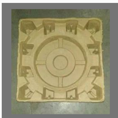
Pulp Molded Tray