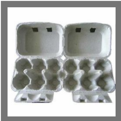
Paper Egg Box