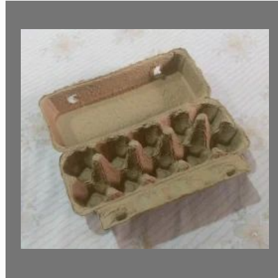
10 Egg Cartons