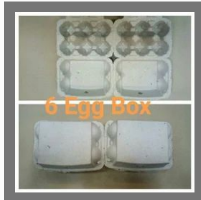
Six Egg Storage Box