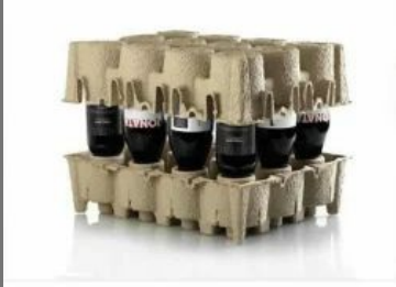
Pulp Molded Pack For Bottle And Jars