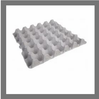
Egg Crate Tray