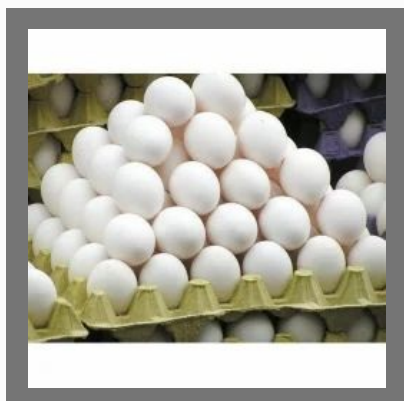
Pulp Egg Tray