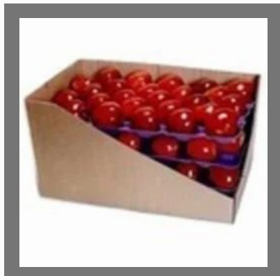
Pulp Molded Apple Tray