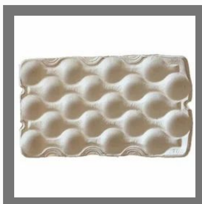
Paper Apple Tray