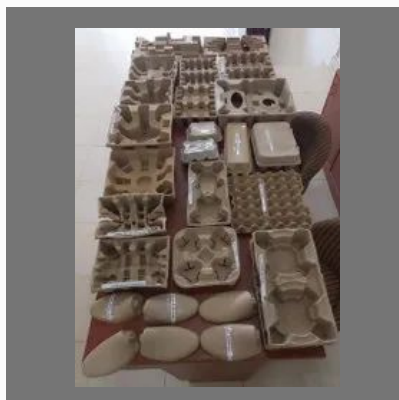
Molded Pulp Packaging