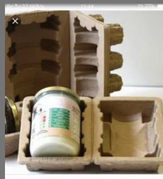
Pulp Molded Clamshell Box For Jars