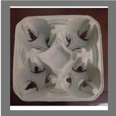
Molded Coffee Trays