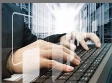
Thin Connect Email