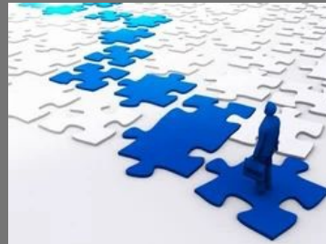
Routing and Context Pop