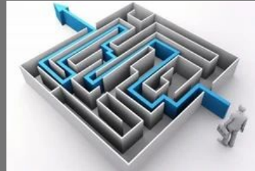
Interactive Voice Response