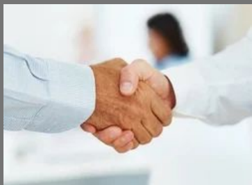
Connector for Microsoft CRM