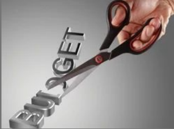
Thin Connect SIP ACD