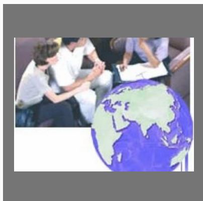
Thin Connect Proactive