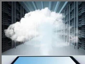
SMS/Voice Notification in the Cloud