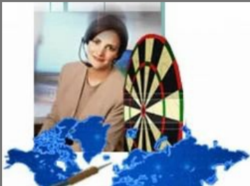
Routing and Context Pop