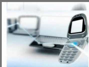
SMS Self Service