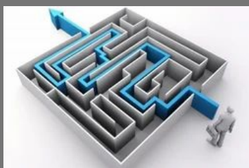
IVR Self Services