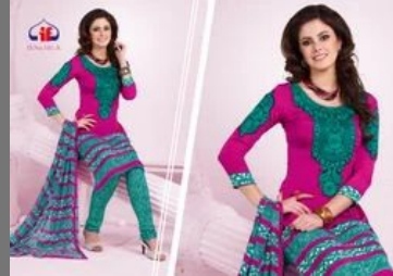
French To French Ladies Suit with Patch Neck Work