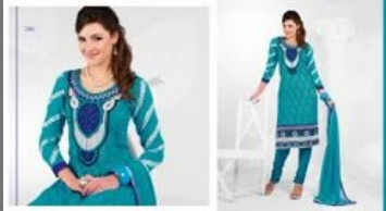
Fancy Printed Suits