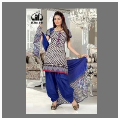
Party Wear Suits