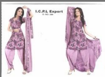
Embroidered Stylish Suits