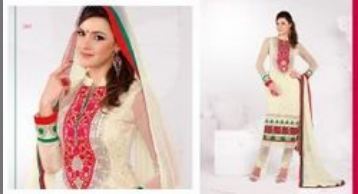
Party Wear Suits for Women