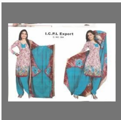
Exclusive Printed Suits