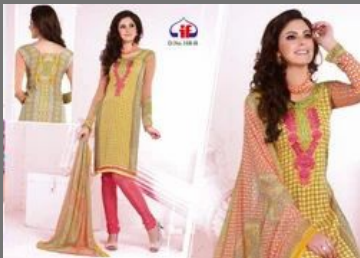
Designers Suit Dupatta