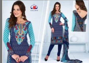
Designers Suit Dupatta