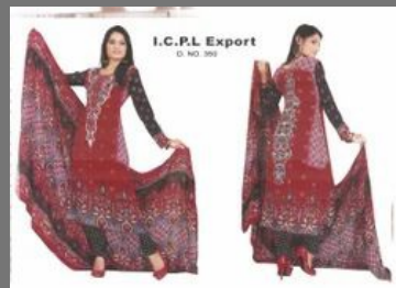
Pure Georgette Suits