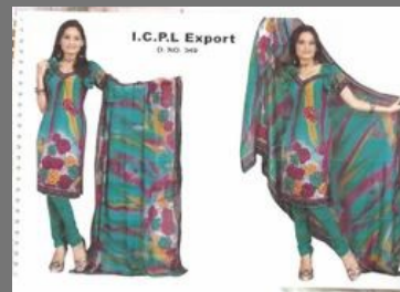
Latest Cotton Suits