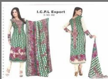
Georgette Embroidery Suits