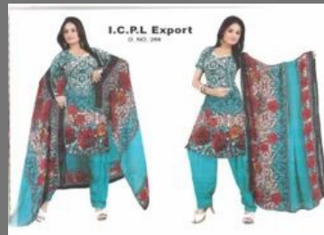
Designer Printed Suits