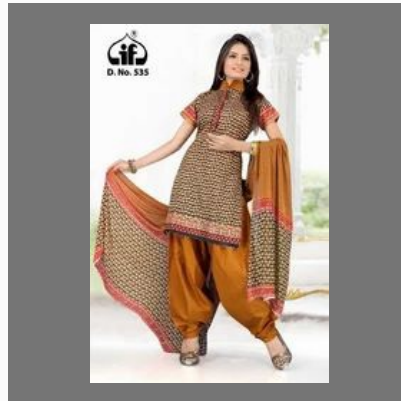
Fancy Embroidery Suits