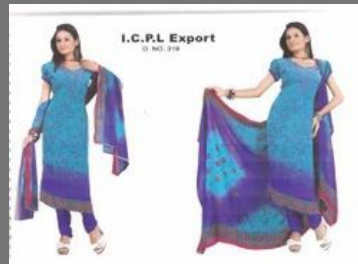
Latest Party Wear Suits