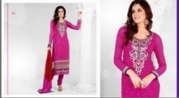
Embroidery Fancy Ladies Suit