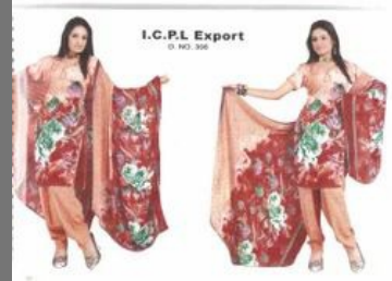
Stylish Printed Suits