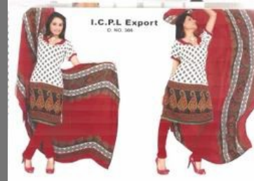
Printed Cotton Suits