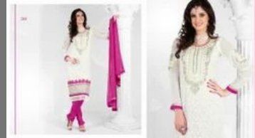
Party Wear Salwar Suits