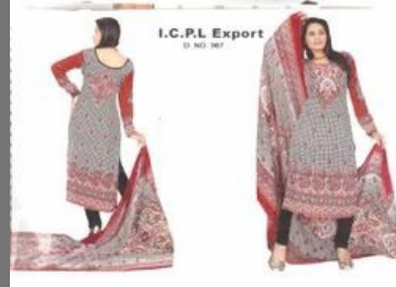
Georgette Designer Suits