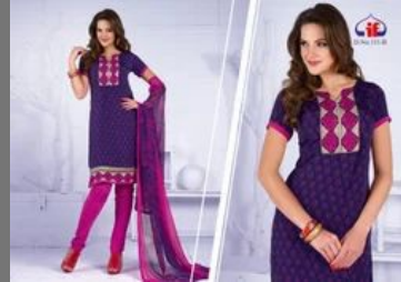
Designers Suit Dupatta