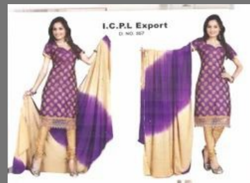
Purple Stylish Suits