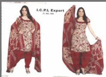
Fancy Embroidery Suits