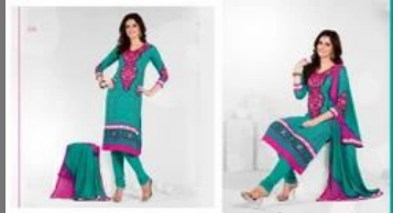
Cheap Cotton Suits