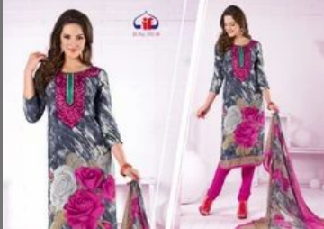
Ladies Printed Suit