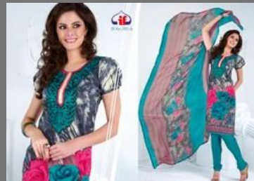
Punjabi Suit Dupatta