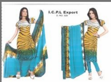
Cotton Printed Suits