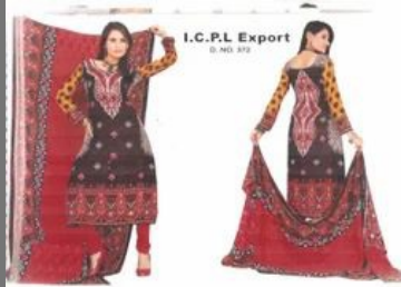
Embroidery Salwar Suits