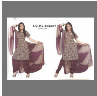
Designer Georgette Suits