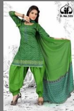
Embroidered Churidar Suits