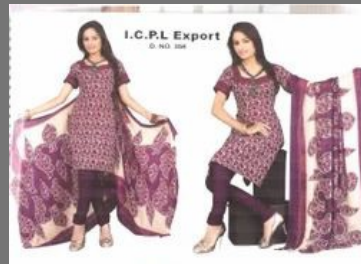
Designer Hand Work Suits