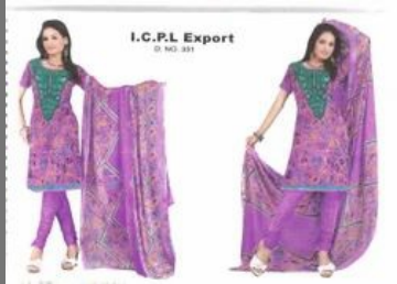
Stylish Salwar Suits