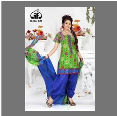
Casual Cotton Suits