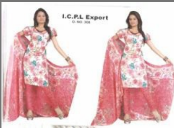
Printed Salwar Kameez & Suits