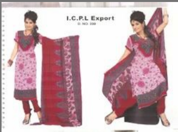
Designer Churidar Suits