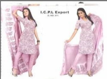
Designer Party Wear Suits