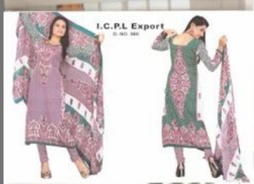
Georgette Salwar Suits