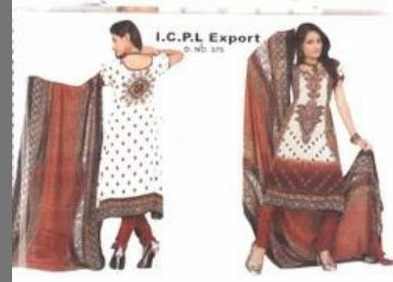
White Embroidery Suits