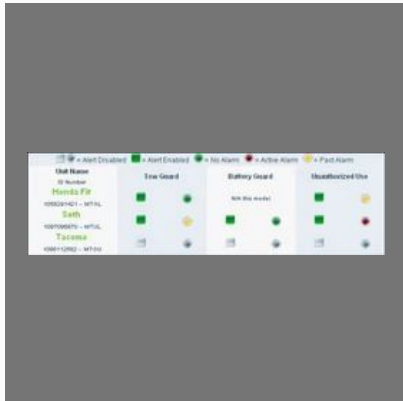
Real Time Alerts