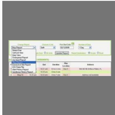
GPS Tracking Software with Automated Vehicle