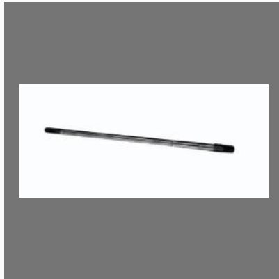
Rear Axle 17.2inch EV Shaft