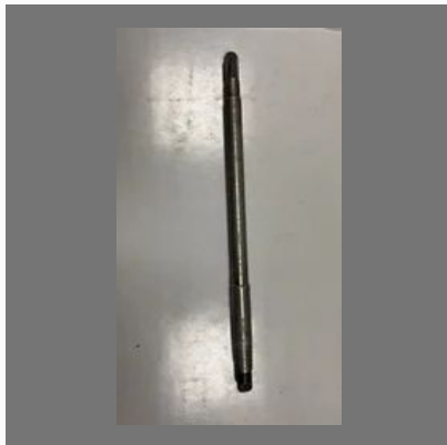
Rear Axle 18.5inch EV Shaft