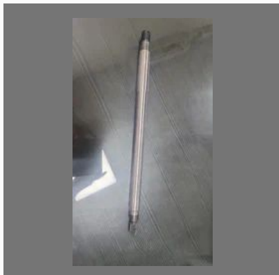
Rear Axle Shaft 18 Inch Old