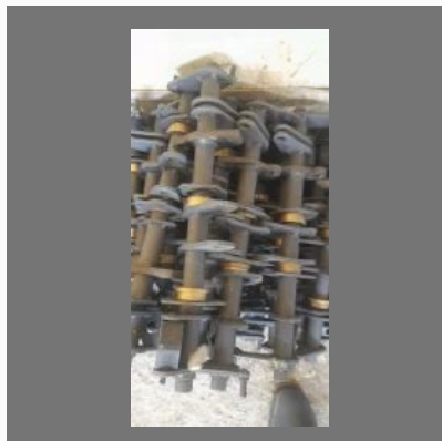
Rmu Welding Shaft