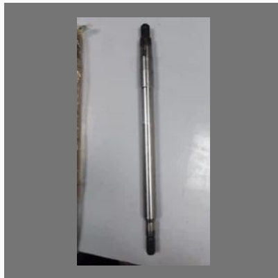
Electric Vehicle Axle Shaft 17.5inch