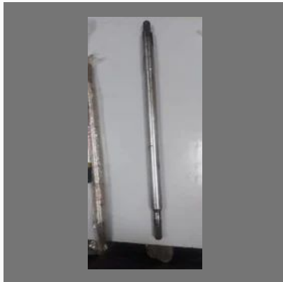
Electric Vehicle Rear Axle 17inch EV Shaft