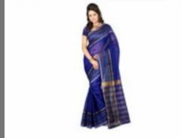
Silk Cotton Sarees