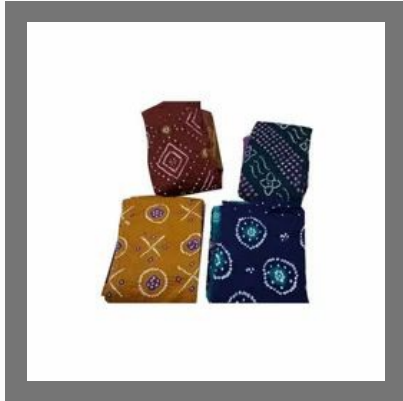
Ladies Suit Material