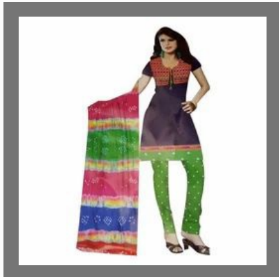
Fancy Ladies Suit