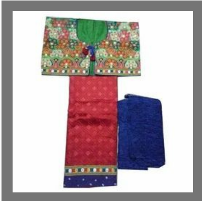
Designer Dress Material