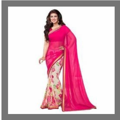
Georgette Party Wear Saree