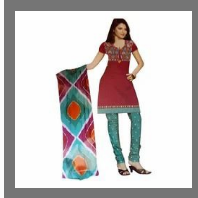
Designer Ladies Suit