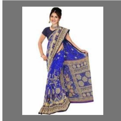
Printed Ladies Saree