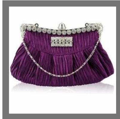
Designer Ladies Bag