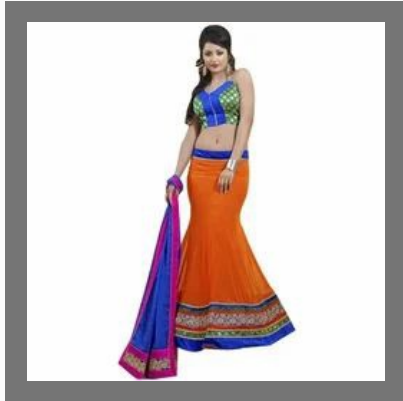
Fancy Chaniya Choli