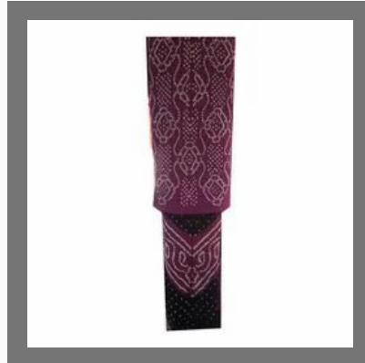
Exclusive Ladies Dress Material