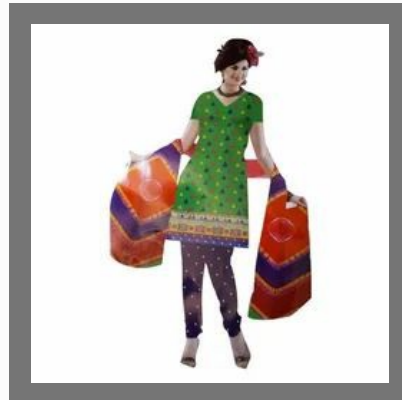
Stylish Ladies Suit