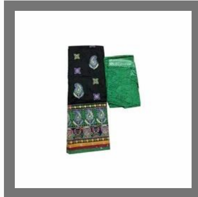
Ladies Dress Material