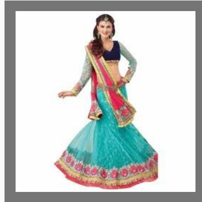
Designer Chaniya Choli