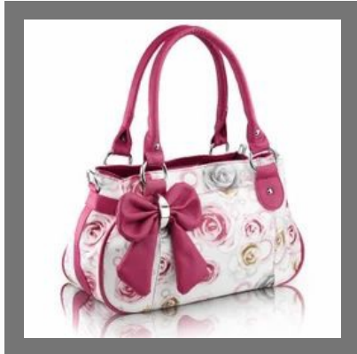
Ladies Hand Bag