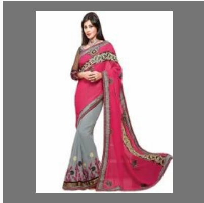
Designer Ladies Saree