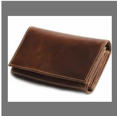
Ladies Leather Purse