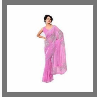
Fancy Ladies Saree