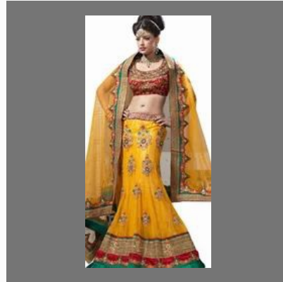
Exclusive Chaniya Choli