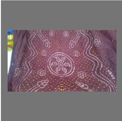
Ladies Printed Dress Material