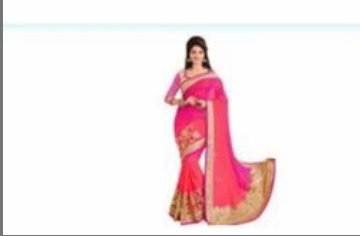
Embroidery Work Sarees