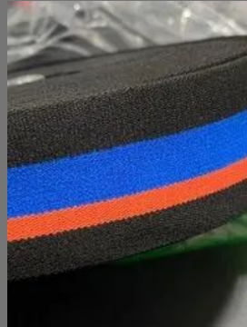
Multi Coloured Buffing Elastic