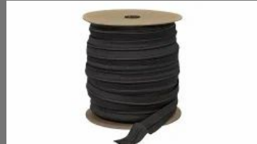
Woven Draw Elastic Cord