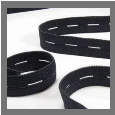
Knitted Ruffle Elastic