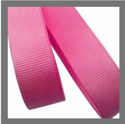
Polyester Grosgrain Ribbon Tape