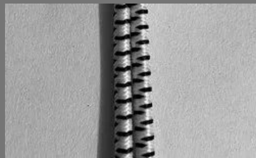
STRIPED CORD ELASTIC