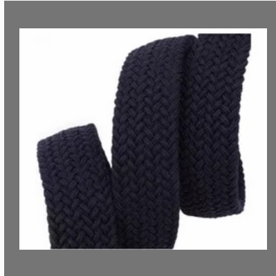
Knitted Belt Elastic