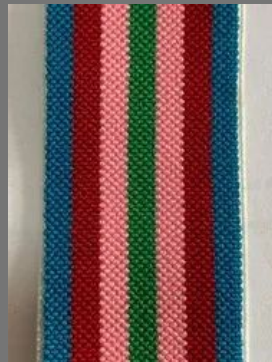
Multi Colour Honeycomb Elastic