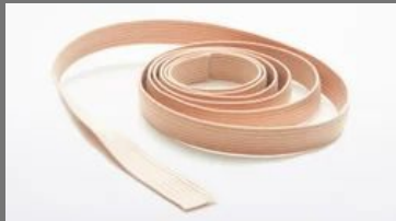
Woven Bloch Ballet Elastic