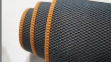
Woven Honeycomb Elastic