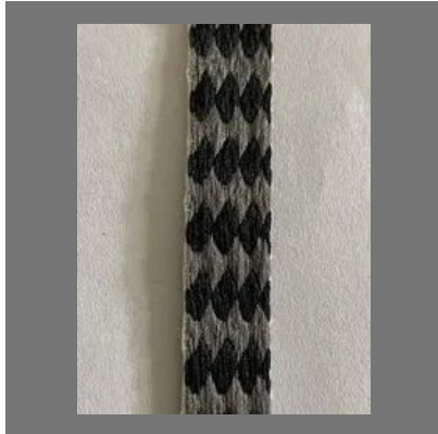
Burfi Design Tape