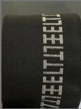
Heavy ( Shoe Quality ) Lurex Elastic