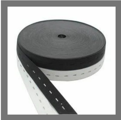
Knitted Buttonhole Elastic