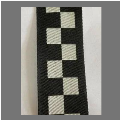
Check Design Tape