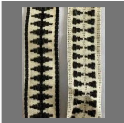
Diamond Design Tape