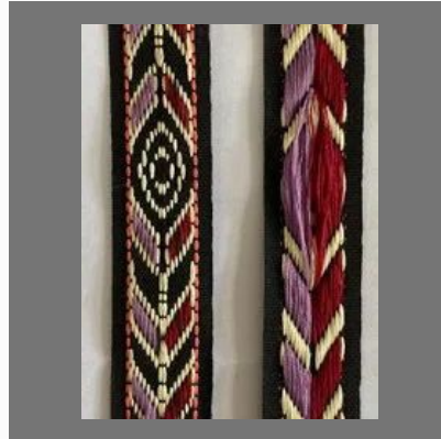
Embroidery Design Tape