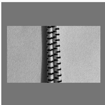
Striped Cord Elastic