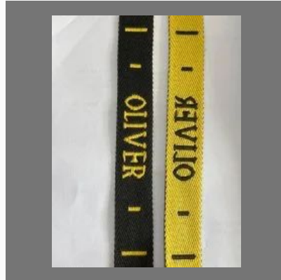
Striped Lurex Gross Grain Tape