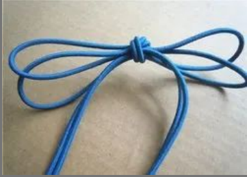
Braided Cord Elastic