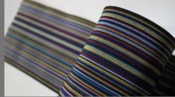
Woven Multi Colored Elastic