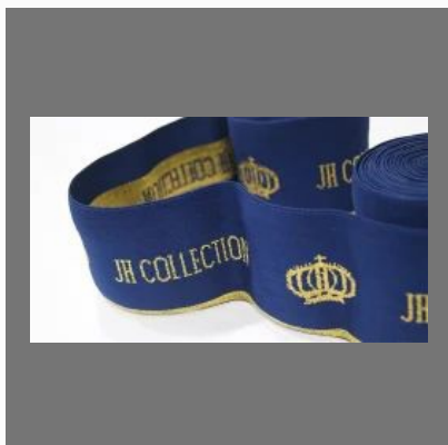
Woven Jacquard Elastic