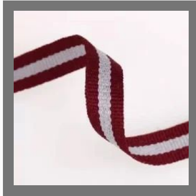
Grosgrain Cotton Tape