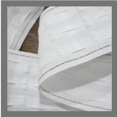
Cotton Curtain Tape