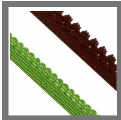
Knitted Kingree Elastic