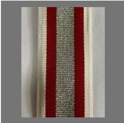
Generic Gross Grain Tape