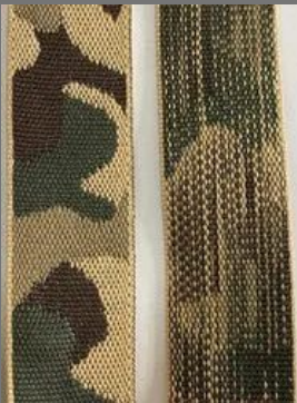
Camo Design Tape