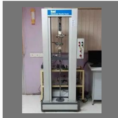
Tear Resistance (Graves Tear) of Plastic Film And Sheeting Testing Services