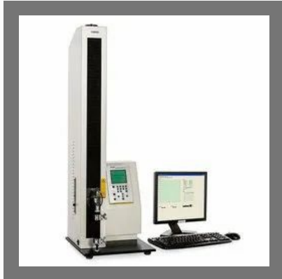
Tear Resistance Testing Service