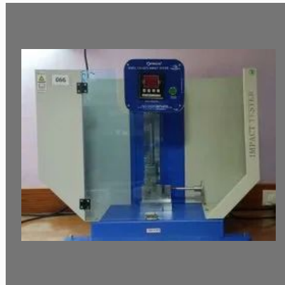
Charpy Impact Strength Testing Services