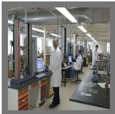
Plastic Testing Service