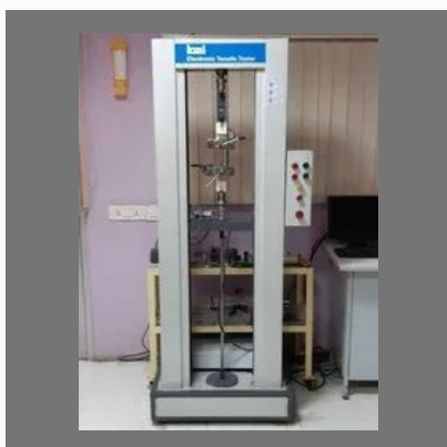
Tensile, Elongation And Modulus Properties Testing Services