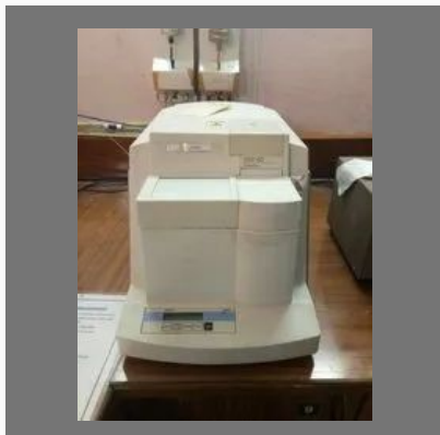
DSC Technique Plastic Testing Service