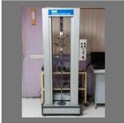
Tear Properties of Rubbers