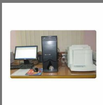
Thermal Analysis Of Rubbers