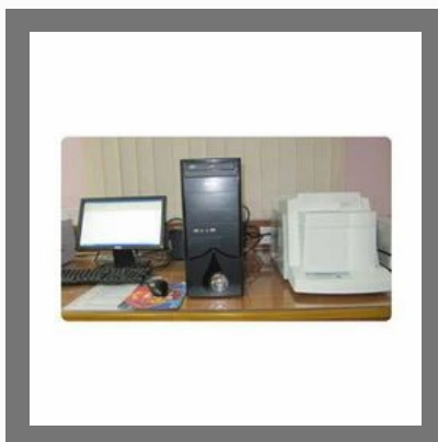
Thermal Analysis of Plastics