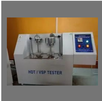
Vicat Softening Temperature of Plastics Testing Services