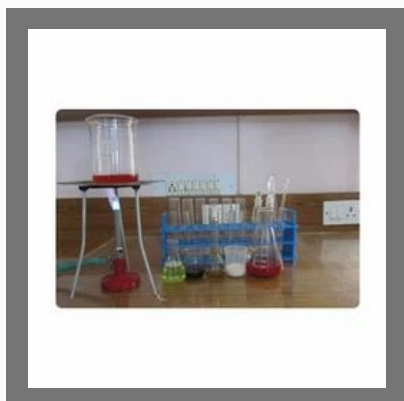
Identification Of Rubber By Chemical Analysis