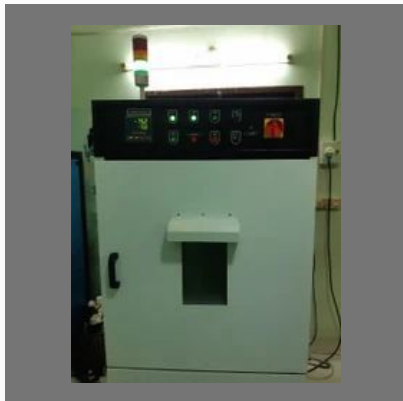
Low Temperature Retraction Test