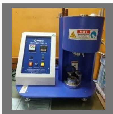
Thin Film Tensile Property Testing Service