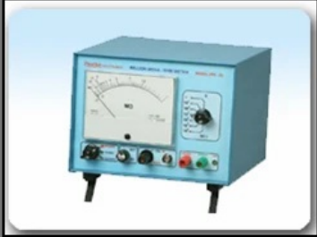
Volume And Surface Resistivity Test