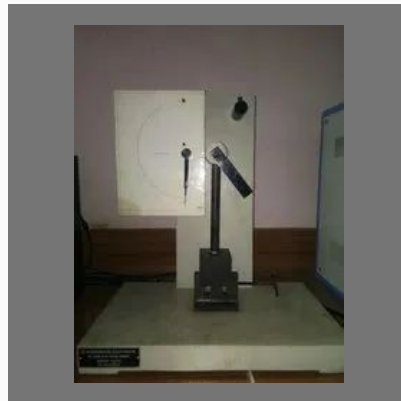
Plastic Izod Impact Testing Service