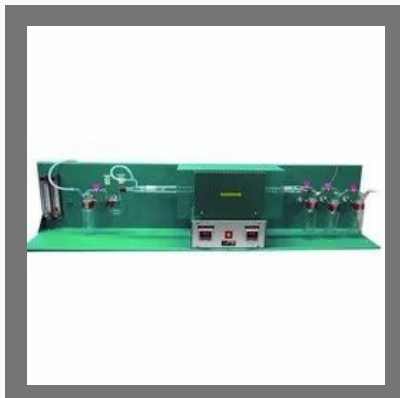
Carbon Black Content In Olefin Plastics Testing Services