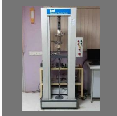
Tensile Properties testing services