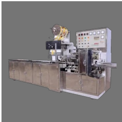
Detergent Cake Packing Machine