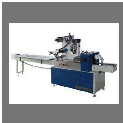
Automatic Shrink Wrapping Machine