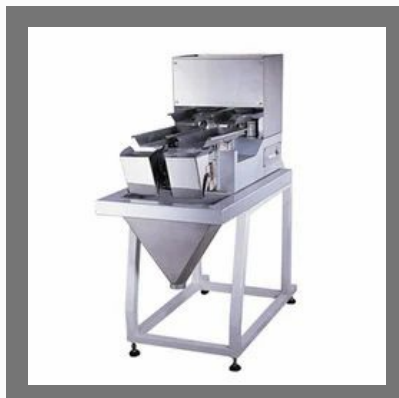
2 Head Linear Weigher