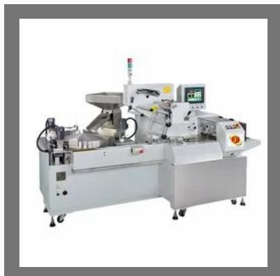
Candy Pillow Pack Wrapping Machine