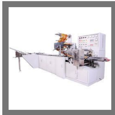
Biscuit & Rusk Packing Machine