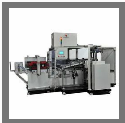
Automatic Case Packing Machine