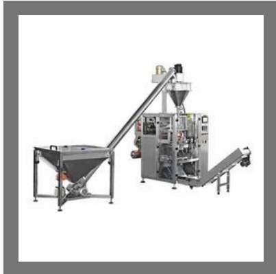
Washing Powder Packing Machine