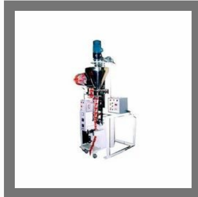
Supari Pouch Packing Machine