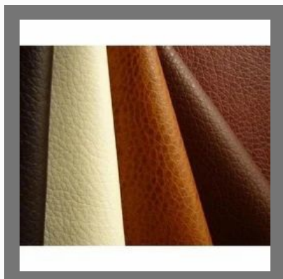
Rexine Artificial Leather