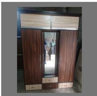
PARTICLE BOARD ALMIRAH