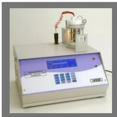
Melting Point Apparatus