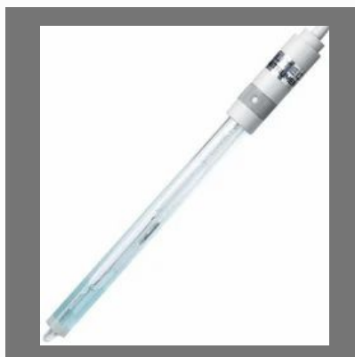
Specialty pH Electrodes