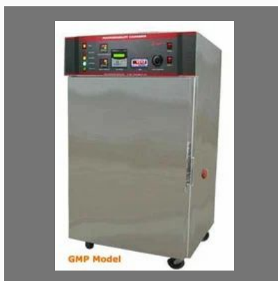
Photo Stability Chamber