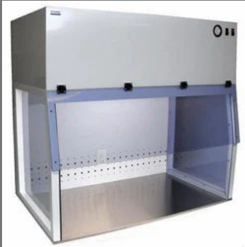
Laminar Flow Bench