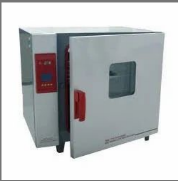
Electro Thermal Drying Oven