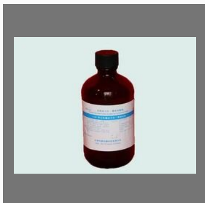
Coulometric Karl Fischer Reagents