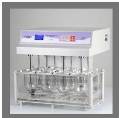
Tablet Dissolution Test Apparatus