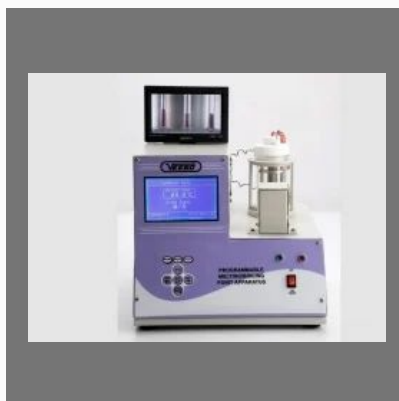
Boiling Point Apparatus