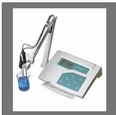
Cyber Scan PH