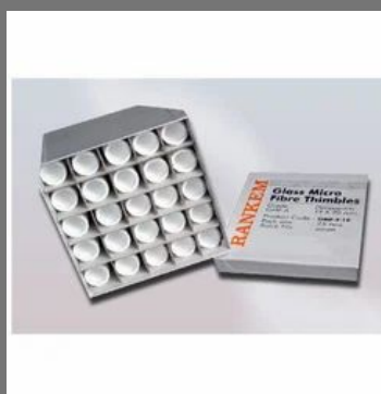
Glass Fiber Filters