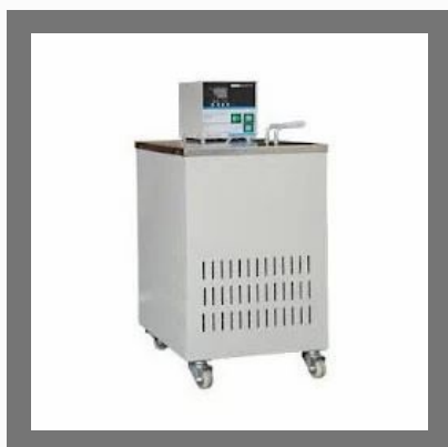
Multi Functional Water Bath