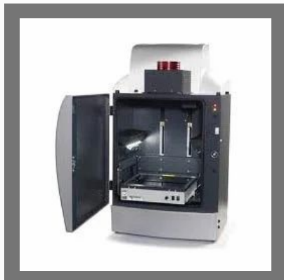
Gel Documentation Imaging System