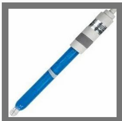
Scientific PH Electrodes