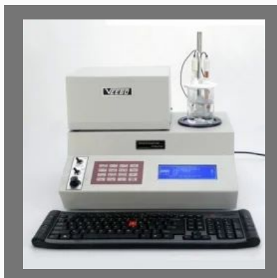
Automatic Potentiometric Titrators