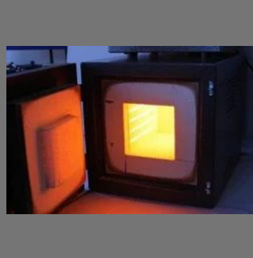
High Temperature Muffle Furnace