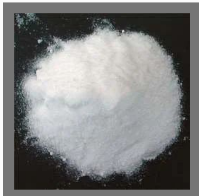
Potassium Acetate ACS