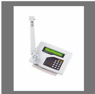
Cyberscan pH 2100