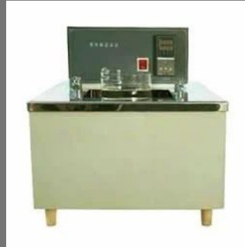
Circulation Constant Temperature Bath