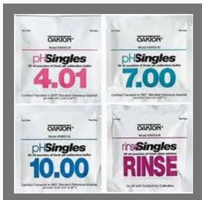
pH Buffer Solutions