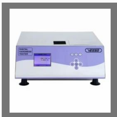
Tablet Hardness Tester