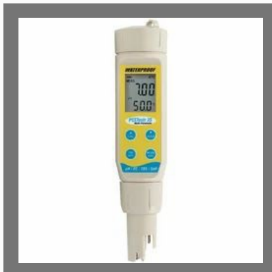
Waterproof Multiparameter Testers