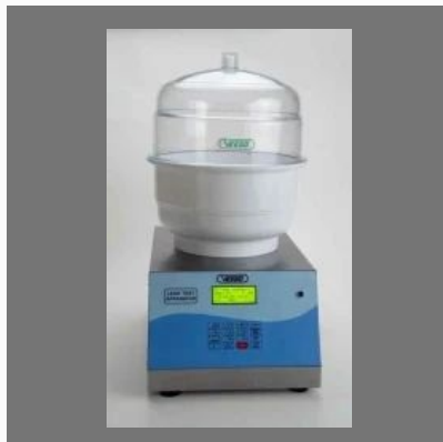
Leak Test Apparatus