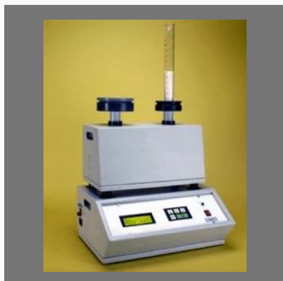
Tap Density Test Apparatus