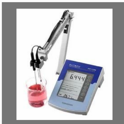
Cyber Scan PH1500