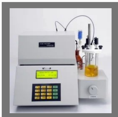
Karl Fischer Titrators