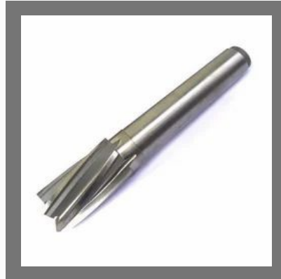
Taper Shank End Mills