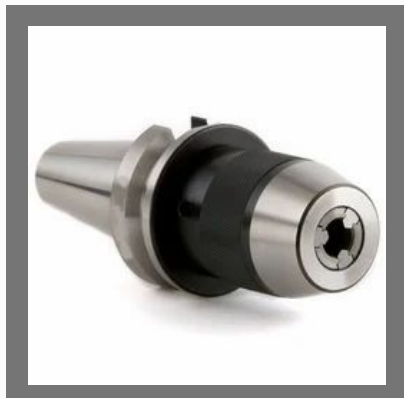
Drill Chuck Holder