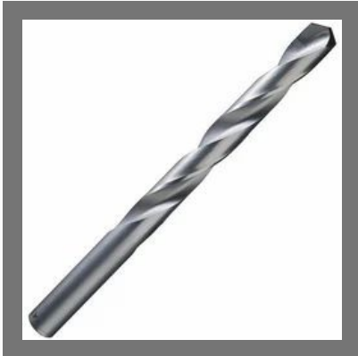
Solid Carbide Deep Hole Drill