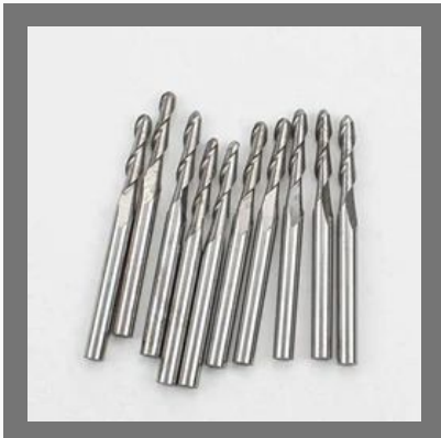
Ball Nose End Mills