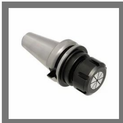
CNC Tool Holder