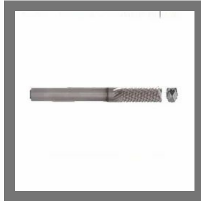
Diamond Grind Router Down Cut