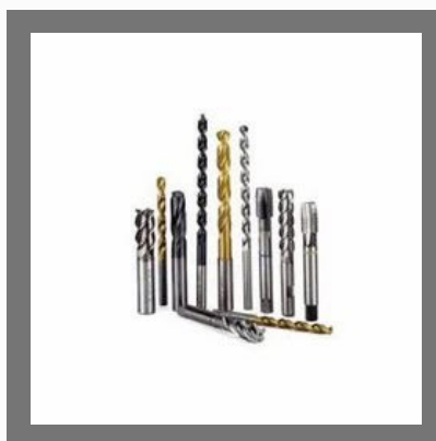
High Speed Steel Drill