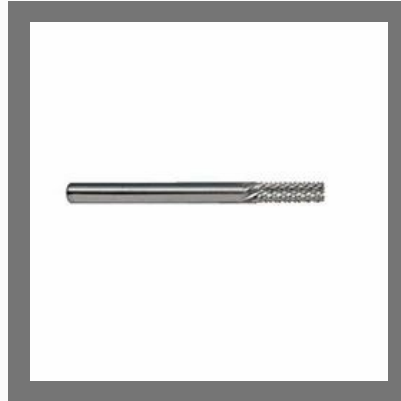
Diamond Grind Router