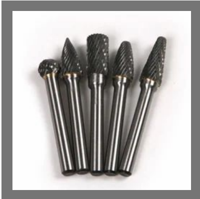
Miniature Rotary Burrs