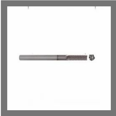
Diamond Grind Router