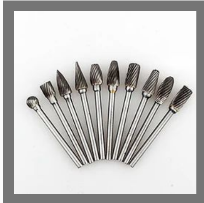
Carbide Rotary Burrs