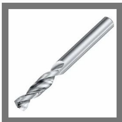
Solid Carbide Stub Drill