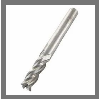
High Speed Steel End Mills