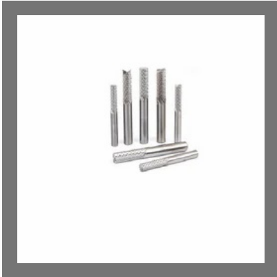
Diamond Grind Router