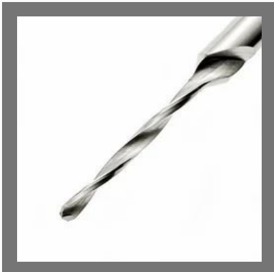
Solid Carbide Tapered Drill