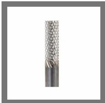
Diamond Grind Router Down Cut Drill Point