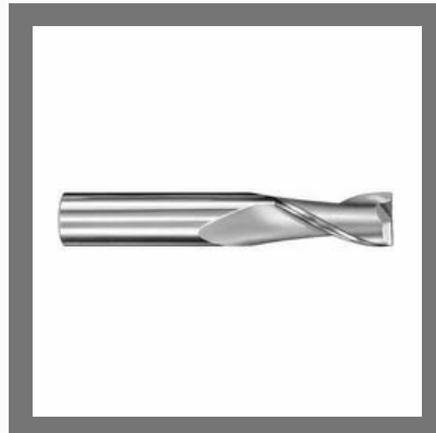
Solid Carbide End Mills