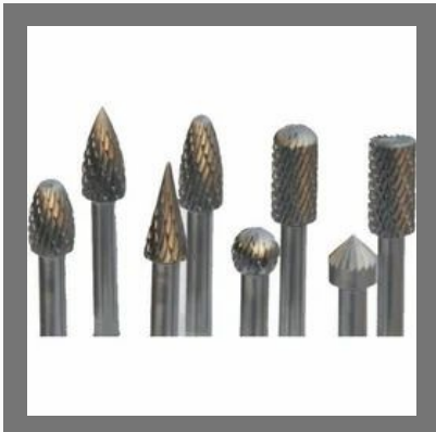
Solid Carbide Rotary Burrs