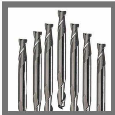
Solid Carbide End Mill