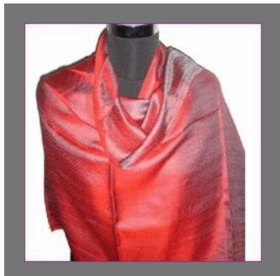
Sheer Silk Shawls