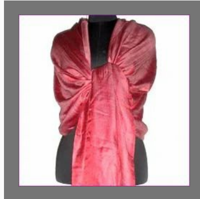
Blended Silk Shawls