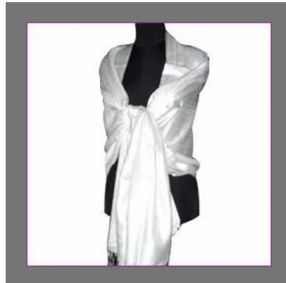
Pure Silk Shawls