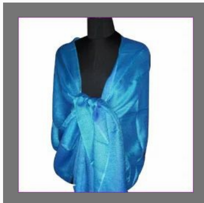
Silk Lace Shawls