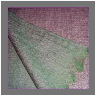
Jamawar Silk Shawls