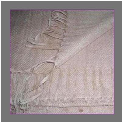
Designer Angora Shawls