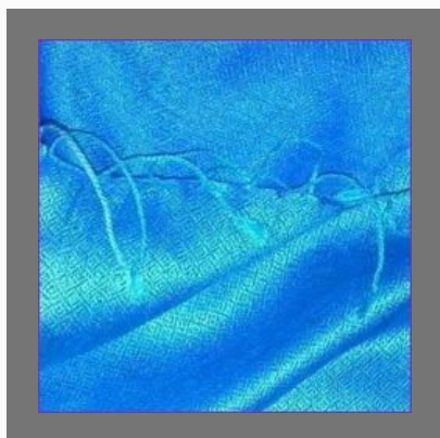
Jacquard Silk Shawls