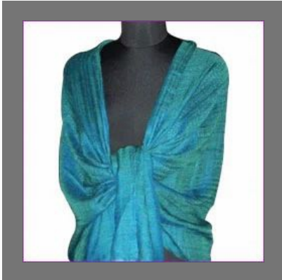
Silk Evening Shawls