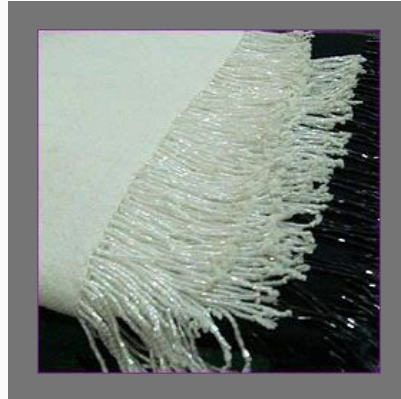
Beaded Silk Shawls