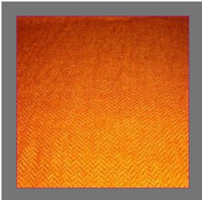
Knitted Silk Shawls