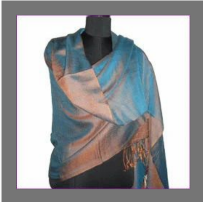
Thai Silk Shawls