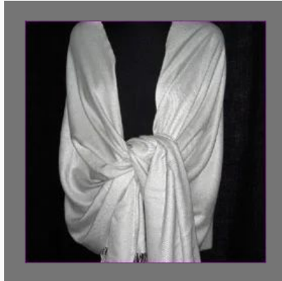
Plain Silk Shawls