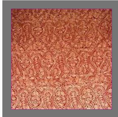
Embroidered Woolen Shawls