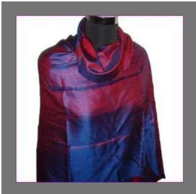
Silk Organza Shawls