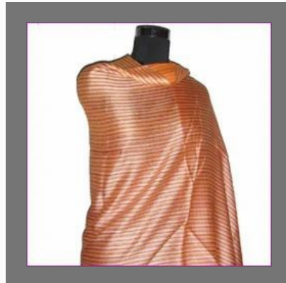
Fancy Silk Shawls