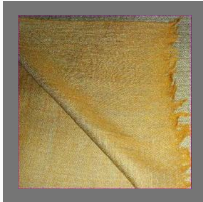
Spanish Silk Shawls