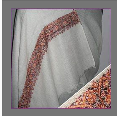
Machine Embroidered Shawls