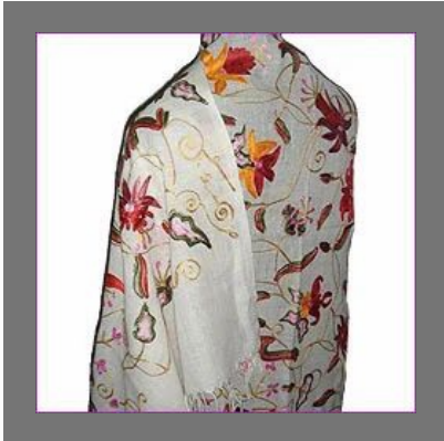
Hand Embroidered Shawls