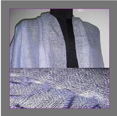
Crochet Silk Shawls