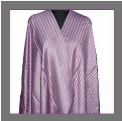
Striped Silk Shawls