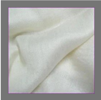
Designer Silk Shawls