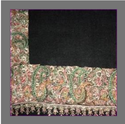
Thread Embroidered Shawls