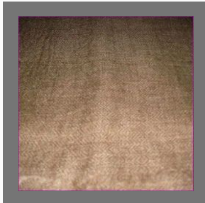
Woven Silk Shawls