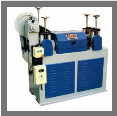
Automatic Wire Straightening Cum Cutting Off Machine