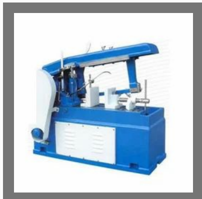
Hydraulic Hacksaw Machine