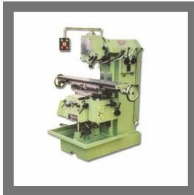
All Geared Vertical Milling Machine