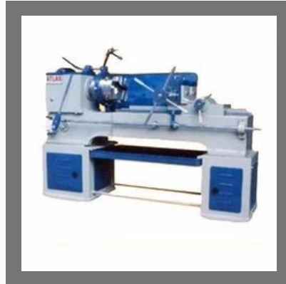
Bolt Cum Pipe Threading Machines