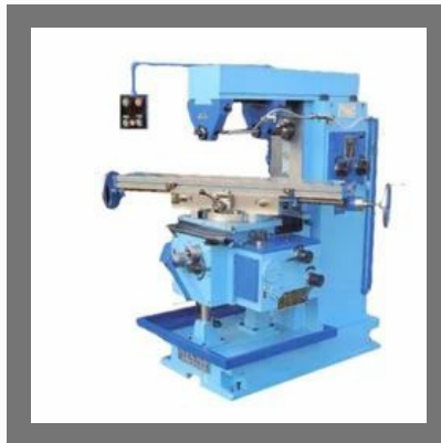
Universal All Geared Milling Machine