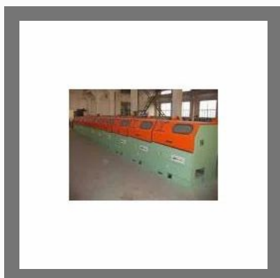
Wire Drawing Machine