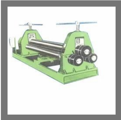
Pyramid Type Plate Bending Machine