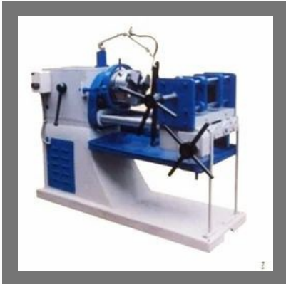
Bolt Cum Pipe Threading Machines