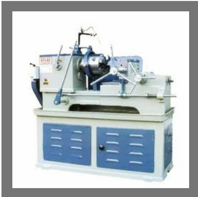
Bolt Cum Pipe Threading Machine