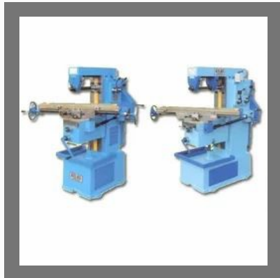
One Feed Automatic Milling Machine