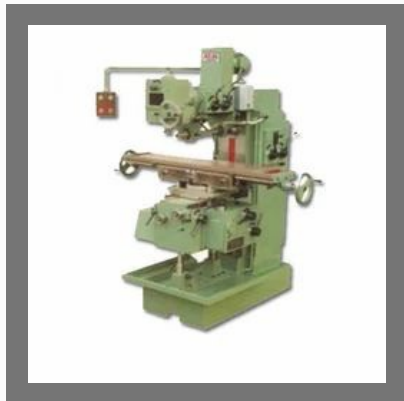
Combine Universal Cum Vertical Milling Machine