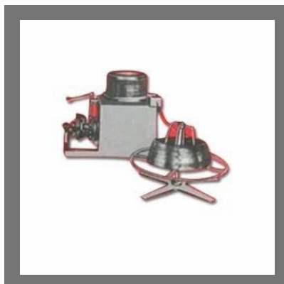
Bull Block Heavy Duty Wire Drawing Machine