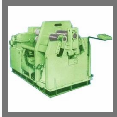
Pinch Cum Pyramid Type Plate Bending Machine