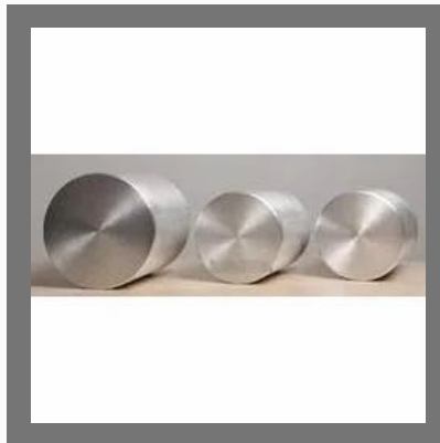
Aluminum Alloy Chemical Testing Services