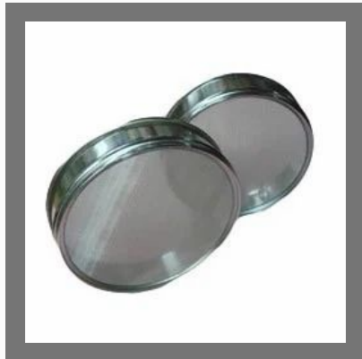
Stainless Steel Chemical Testing Services