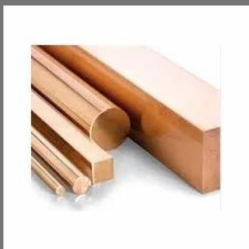
Copper Alloy Chemical Testing Services