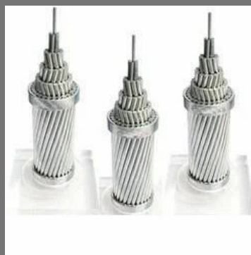
Aluminium Alloy Mechanical Testing