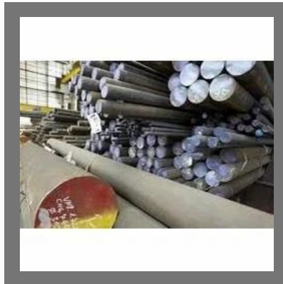
Low Alloy Steel Chemical Testing Services