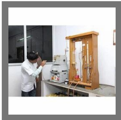
Plain Carbon Steel Chemical Testing Services