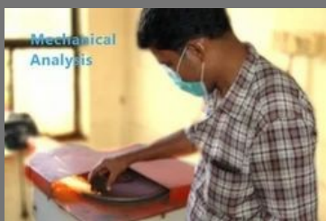
Copper Alloy Mechanical Testing