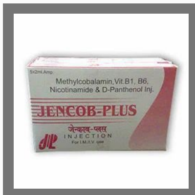
Jencob Plus Injection