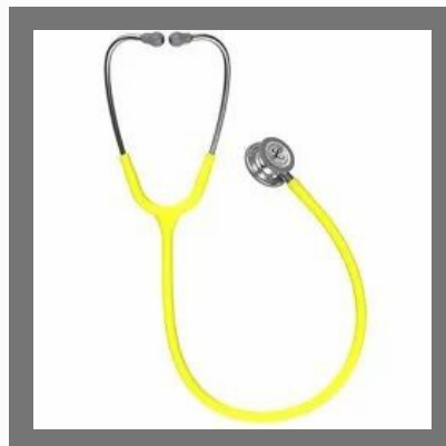
3M Littmann 5839 Classic III Stethoscope