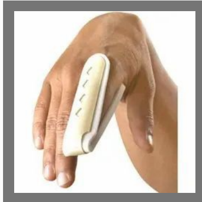
Finger Extension Splint