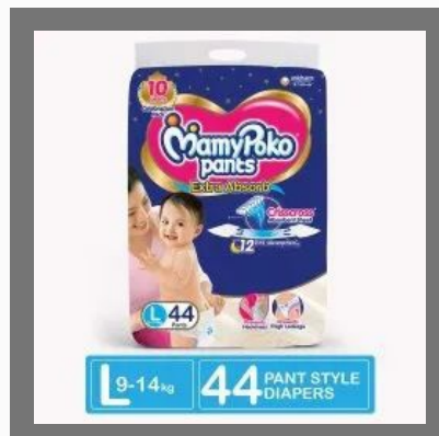
MamyPoko Pant Style NB-1 Large Size Diapers Pack Of 44