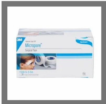
Micropore 1530S-3 Surgical Tape