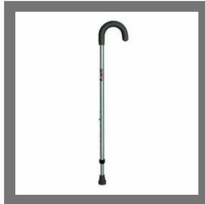
Vissco Invalid U Shaped Walking Stick (0910)