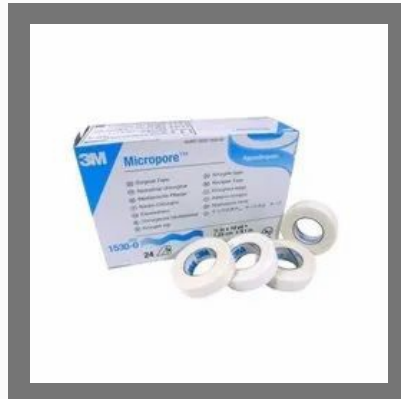
3M Micropore 1530-0 Surgical Tape