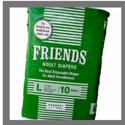
Friends Large Adult Diapers