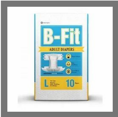
B-FIT Large Adult Diaper