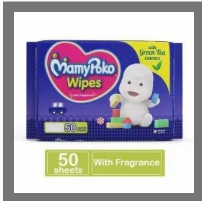
50 Sheets MamyPoko Soft Baby Wipes