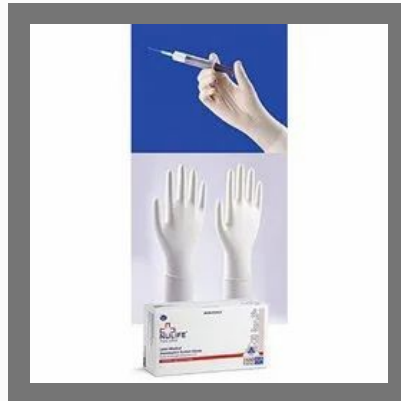
Nulife Latex Examination Powdered Gloves, Box Of 100