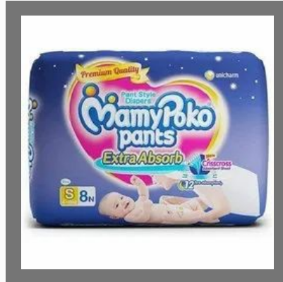
8Pcs MamyPoko Pants Small Size Diapers