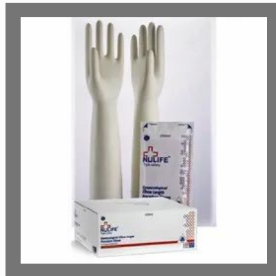
Elbow Length Gynecology Sterile Gloves(MEDIUM)