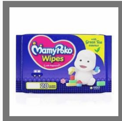
20 Sheets MamyPoko Baby Wipes