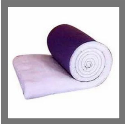
Absorbent Cotton Roll