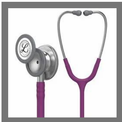
3M Littmann 5831 Classic III Stethoscope