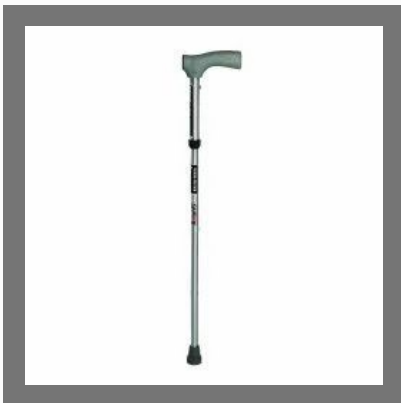
Vissco Invalid L-shaped Walking Stick (0911)