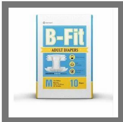
B-FIT Medium Adult Diapers