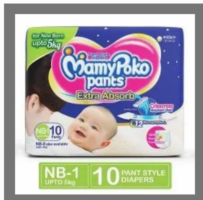
MamyPoko Pant Style NB-1 Size Diapers