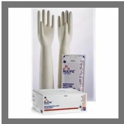
Nulife Elbow Length Sterile Gloves(LARGE)