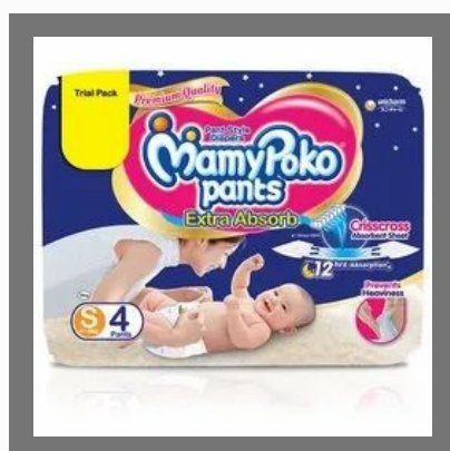
MamyPoko Pants Small Size Diapers