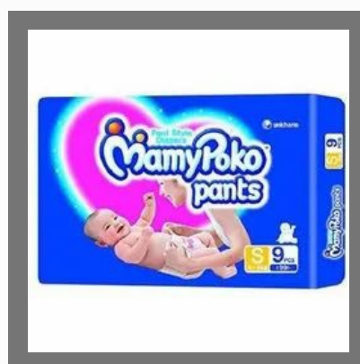
9 Pcs Mamy Poko Pant Small Size Diapers