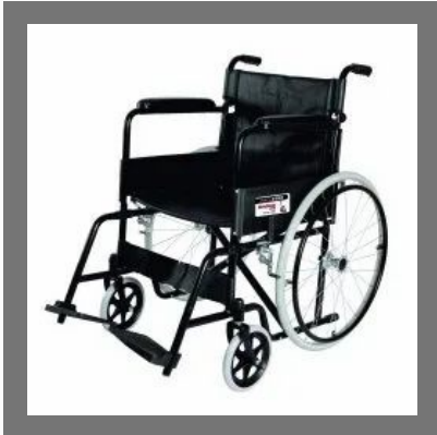
Modified Black Magic Wheelchair Spoke Wheels(P.C.no.0975)