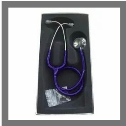
Double Side Stethoscope