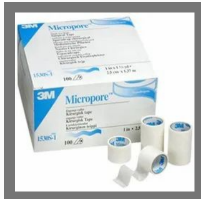
3M 1530S-1 Micropore Tape