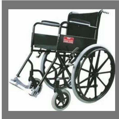
Vissco Black Magic Wheelchairs (P.C.no.0983)