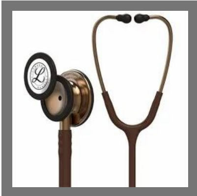
3M Littmann 5809 Classic III Stethoscope