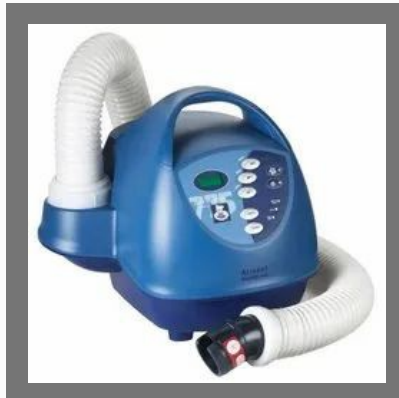
3m Bair Hugger Warming Units