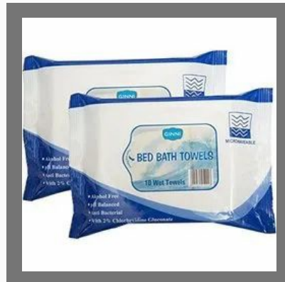
Ginni Face CleanING Wipe