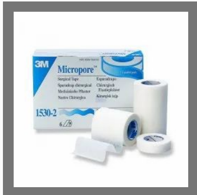
3M Micropore 2 Inch Surgical Tape