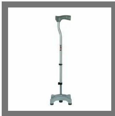
Vissco Invalid Quadripod Walking Stick L-Shape (0909)