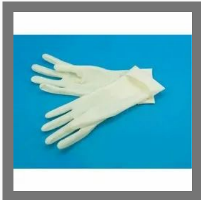
Latex Surgical Gloves