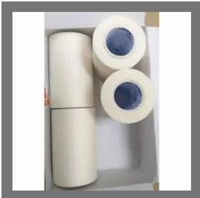
Transpore Surgical Adhesive Tape