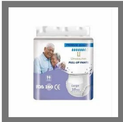
Uphealthy Adult Pull Up Diapers