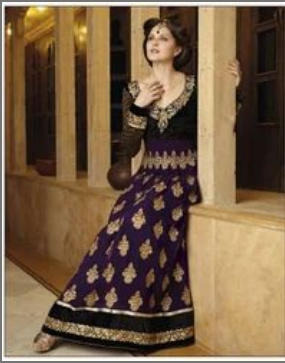
Women Designer Pakistani Suits