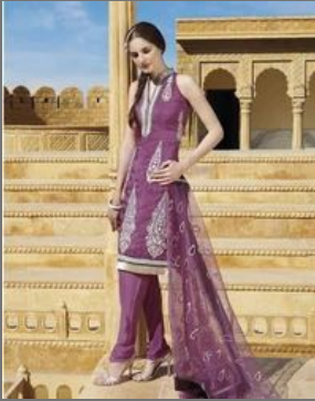
Ladies Pakistani Suits