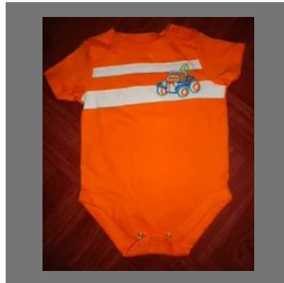
Kids Romper Suits