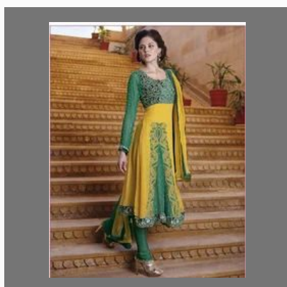
Designer Salwar Suits