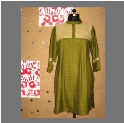
Stylish Designer Kurti