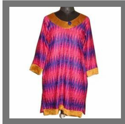
Designer Printed Kurtis