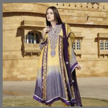
Fancy Ladies Suit