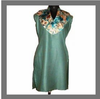
Designer Printed Kurtis