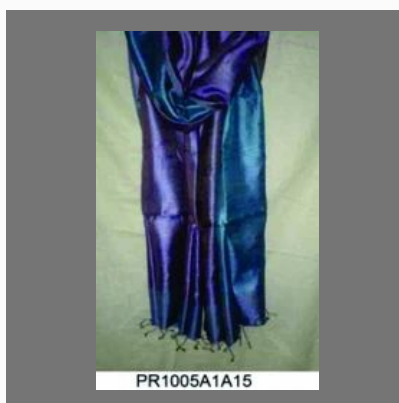
Trendy Silk Stoles & Scarves