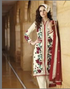
Pakistani Designer Suits