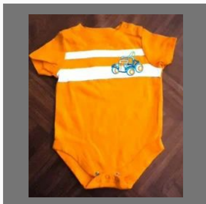
Kids Romper Suits