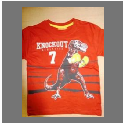
Kids T- Shirt