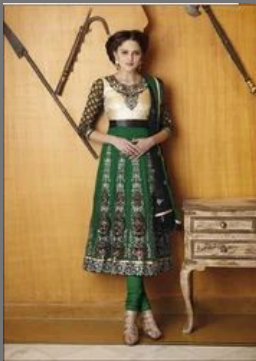
Ladies Designer Suits