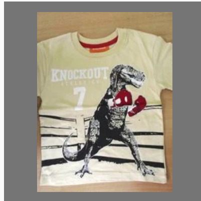
Kids T- Shirt