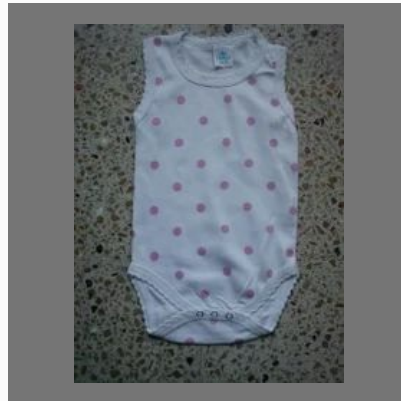
Sleeveless Kids Rompers