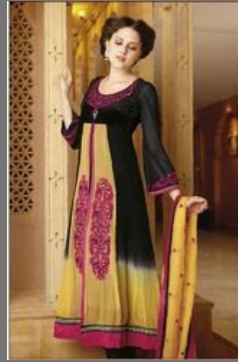
Stylish Pakistani Suits