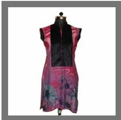
Ladies Printed Kurtis