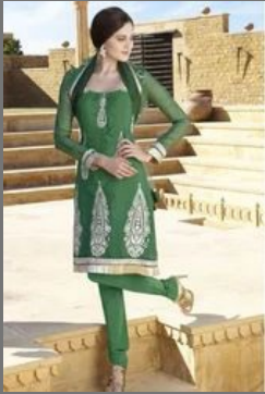
Fancy Ladies Suits