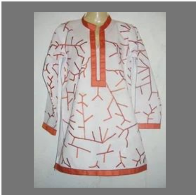
Machine Embroidered Kurtis