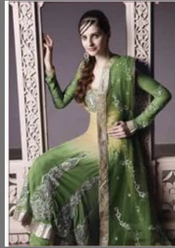
Women Fancy Salwar Kameez