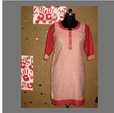
Designer Printed Kurtis