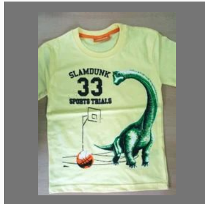
Kids T- Shirt