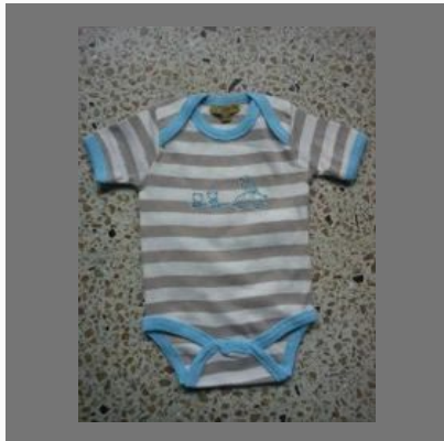
Baby Romper Suits