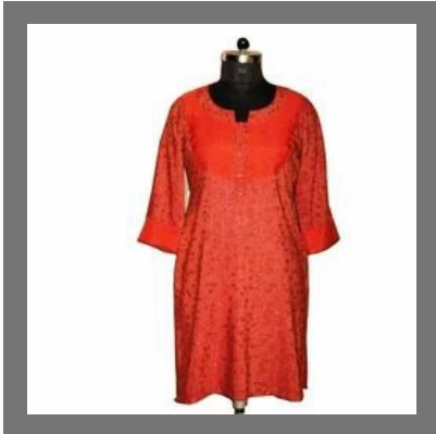
Ladies Fancy Designer Kurtis