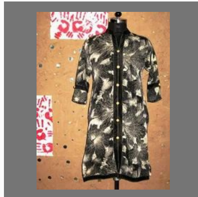
Designer Printed Kurtis