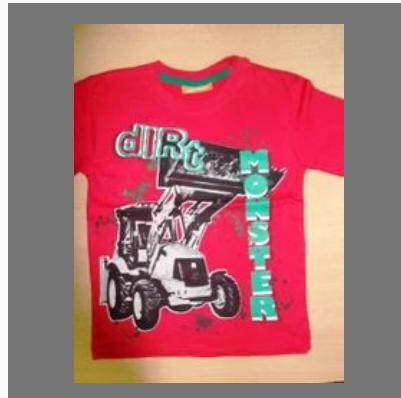
Kids T- Shirt