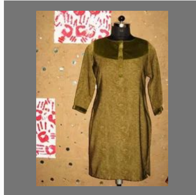
Ladies Stylish Designer Kurti