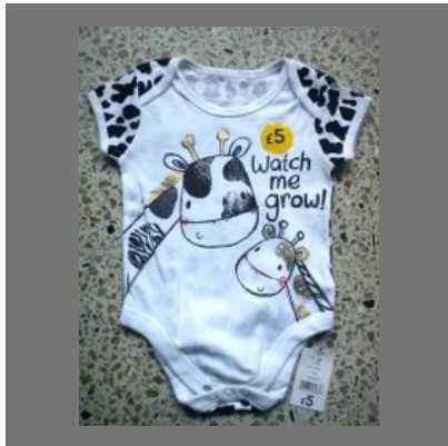
Sleeved Kids Rompers