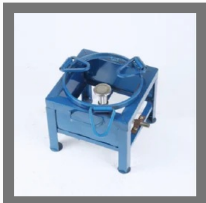
Gas Stove Burner