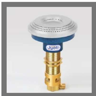
Commercial Gas Burner