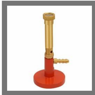
Bunsen Burner No.1