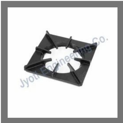
Cast Iron Square Pan Support