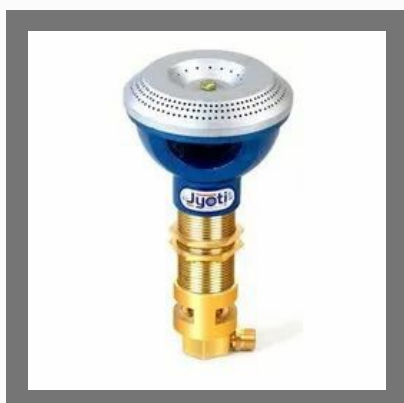
Heavy G - 11 Head