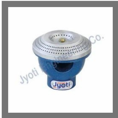
G 9 Burner