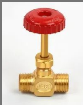
MANIFOLD VALVE / MAIN LAIN VALVE