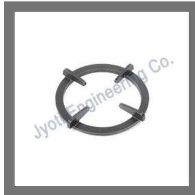
Cast Iron Round Rings