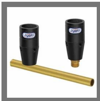
Tea LPG Burners