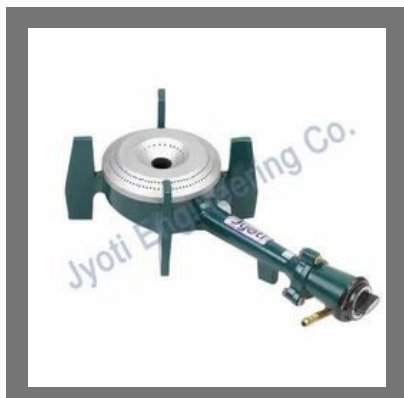
L.P. Super Canteen Burner