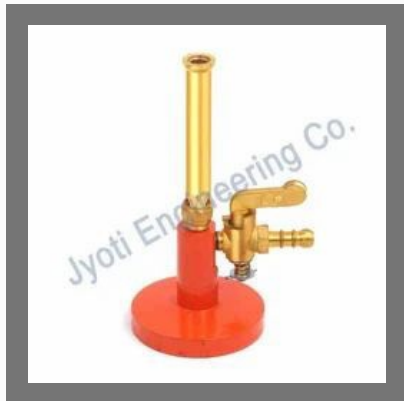
Bunsen Burner No .1