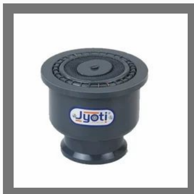
T - 78 Burner