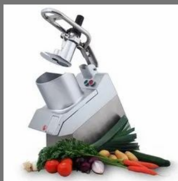
Vegetable Cutter Machine - 2HP