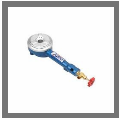
Mini Bottom Burner