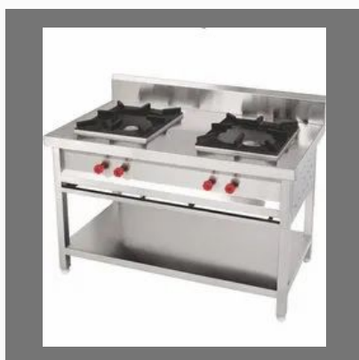
2 BURNER COOKING RANGE