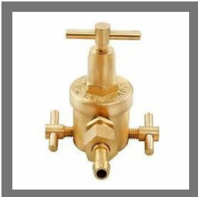
KEY TYPE REGULATOR