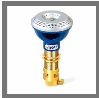
T - 78 Assembly