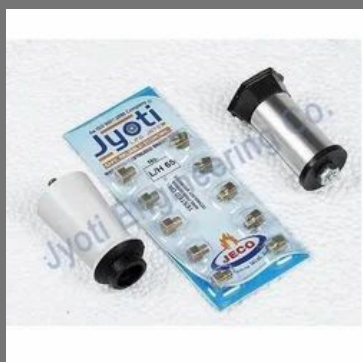
L. P. G. Stove"s Spares