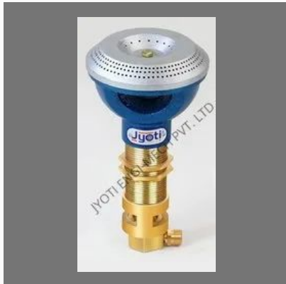
Heavy G-11 Head