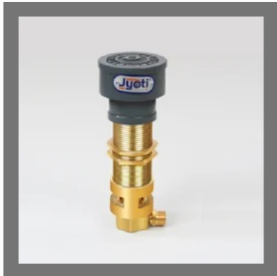
Supreme Torch Burner