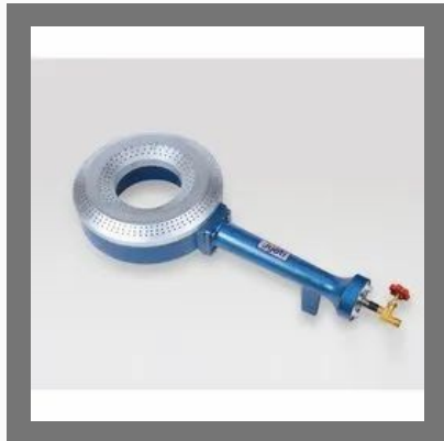
Giant Jumbo Bottom Burner