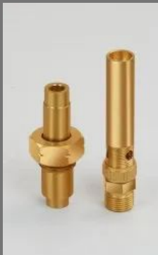
ACCESSORIES (MS UNION) / (PILOT BURNER)