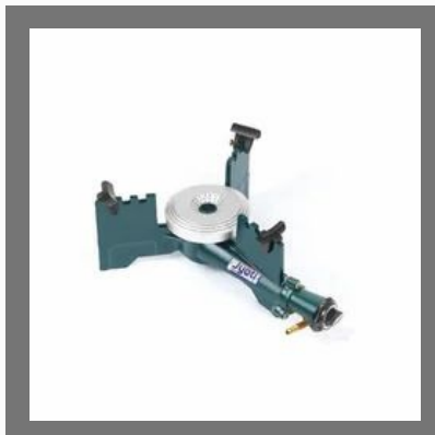
L.P. Sunbeam Canteen Burner