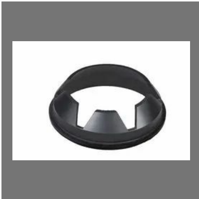
Chinese Dome ( Round Dom)