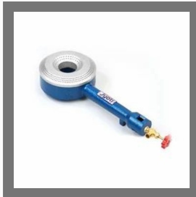
Jumbo Bottom Burner