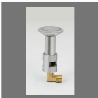
MS Nutan LPG Burner