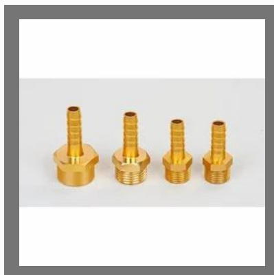
Brass Hose Nipples