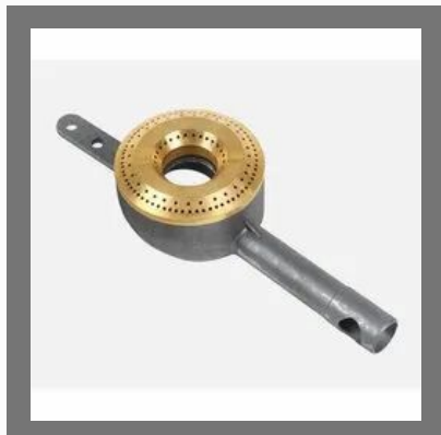
Stove Bottom Burner