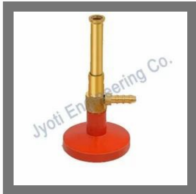
Bunsen Burner NO.1 (HALF BRASS)