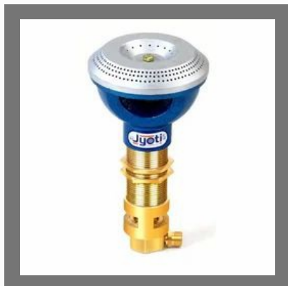
G 11 Burner Set