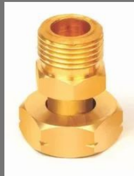
ACCESSORIES (NON RETURN VALVE)