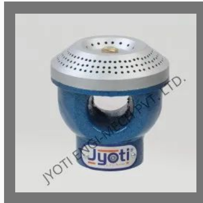
Heavy G-9 Head