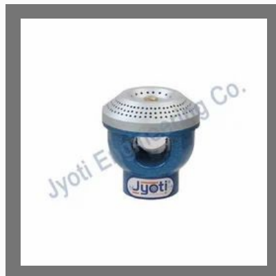
G Head Burner