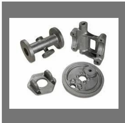
Grey Iron Casting