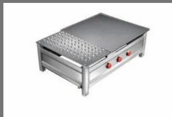
CHAPATI PLATE WITH PUFFER