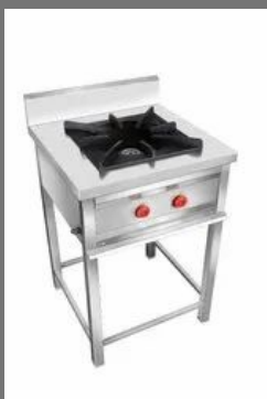
SINGLE BURNER RANGE