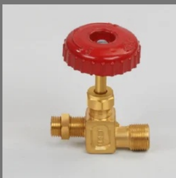
Brass Stove Parts