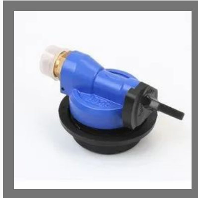
Sierra Type Adaptor