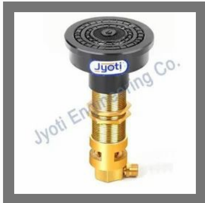
T - 65 Burner With Assembly