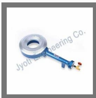
Giant Jumbo Bottom Burner