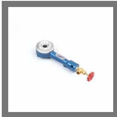
Baby Bottom Burner