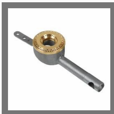
Aluminum Mixing Tubes Burner