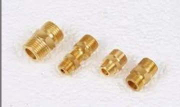
H.P Fitting Adapter