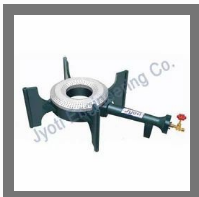
Giant Jumbo Canteen Burner (H.P)