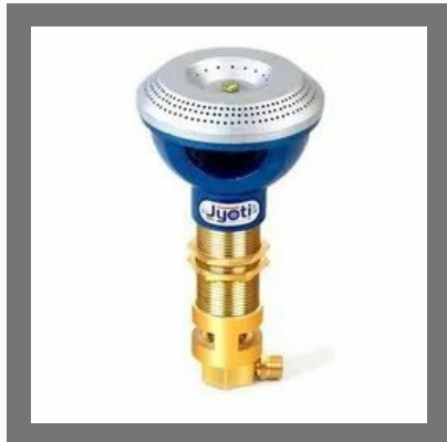
T - 50 Assembly