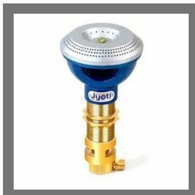
Heavy T - 22 Assembly