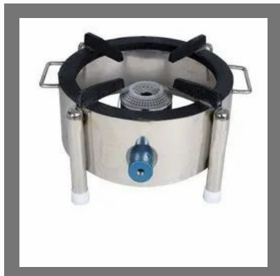
S.S. Round Bhatthi 10"