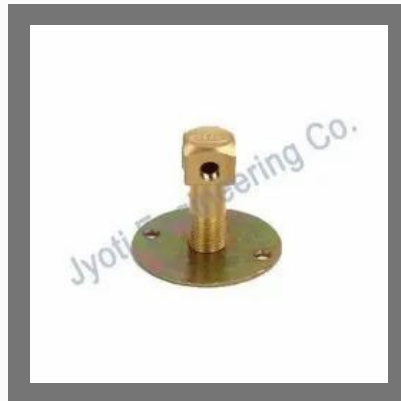
Terminal Block / Tap Cock