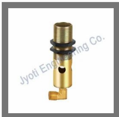
Jet Elbow Assembly