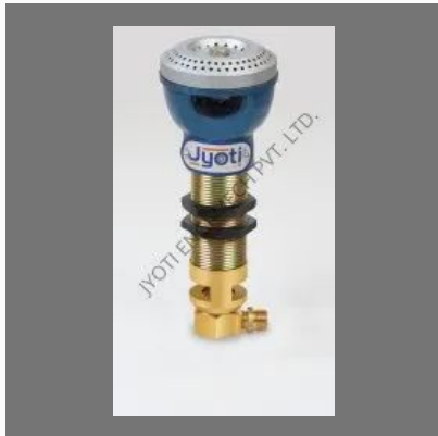
Heavy G-8 Head Burners