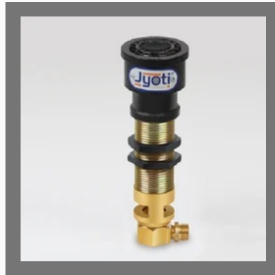
T 22 Torch Burner