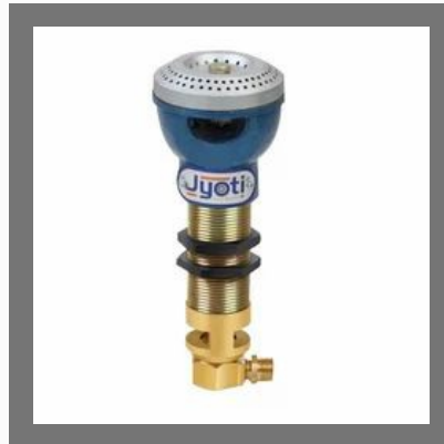
G-8 Head Burners