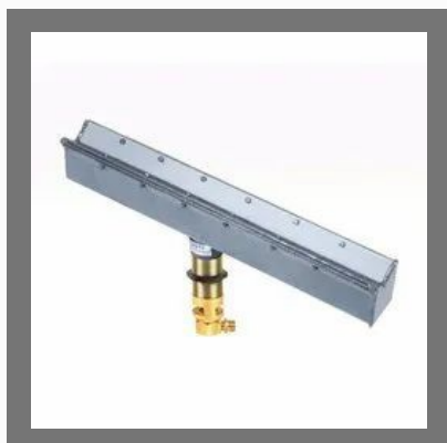
R.V. Burner Center Socket