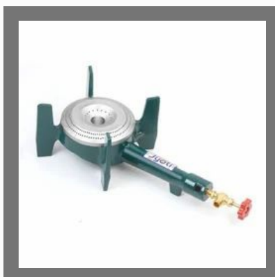
Super Canteen Burner (H.P)