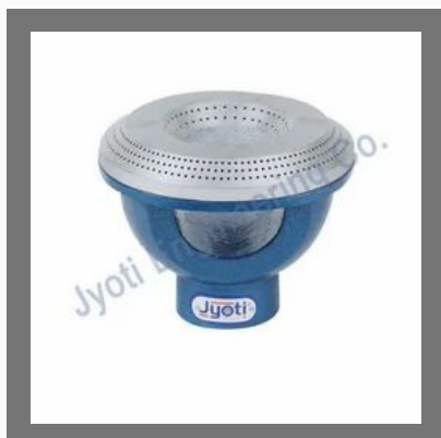
G 12 Burner