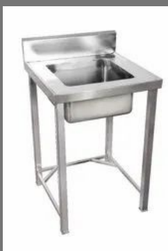
HAND WASH SINK