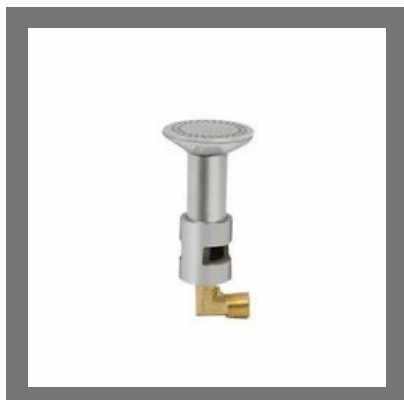
Tea LPG Burner