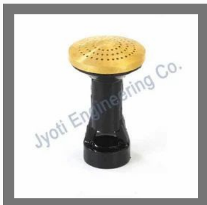
Nutan Mixing Tubes Burner