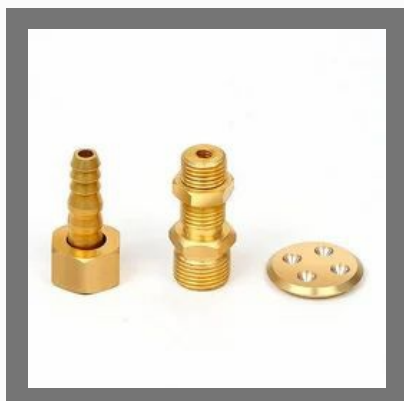
Brass Fitting Spares