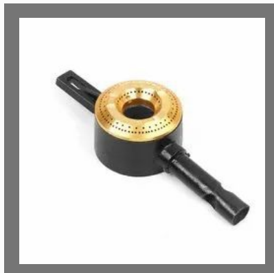
Stove Bottom Burner