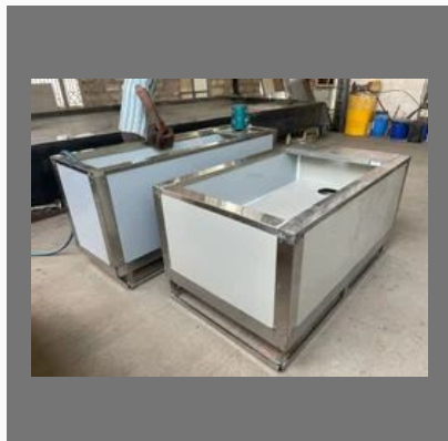
Kulfi Machine 6 Moulds