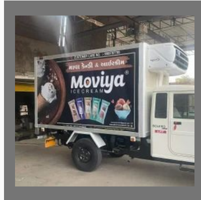
Mahindra bolero Ice Cream Refrigerated Container Van