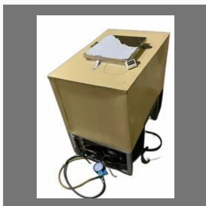
60/70/80 L Glycol Freezer