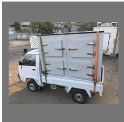
FOW for tata ace refrigerated container