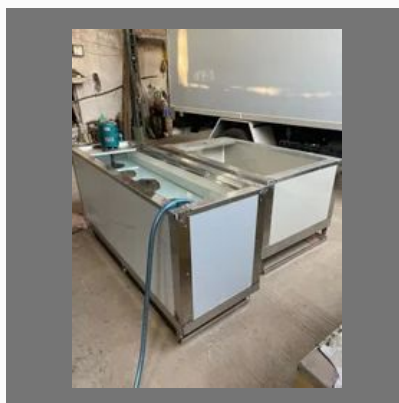
Ice Cream Candy Plant 7 moule