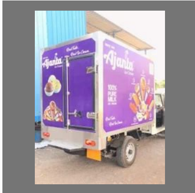
Ice Cream Refrigerated Van