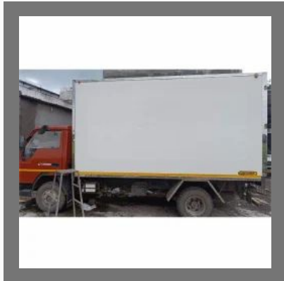
Freezer Container Mobile Refrigerated Truck