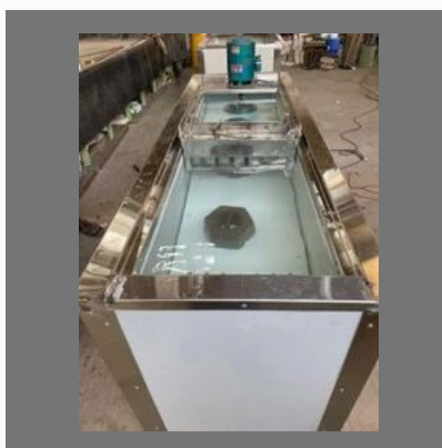
Ice Cream Candy Plant 6 Mould