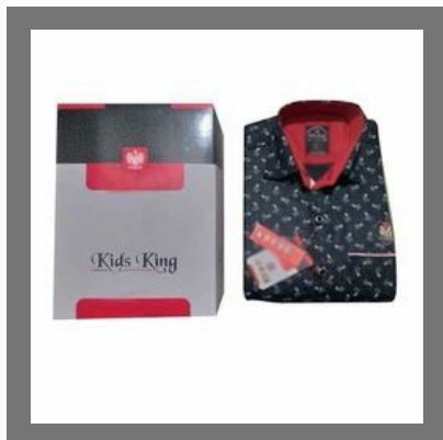
Printed Kids Shirt