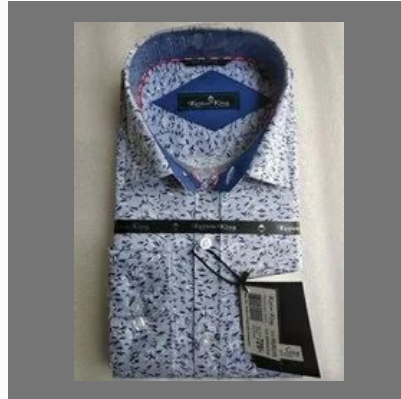
Men Printed Cotton Shirt