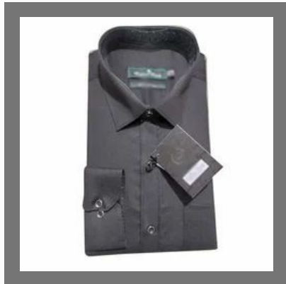
Mens Cotton Casual Shirt