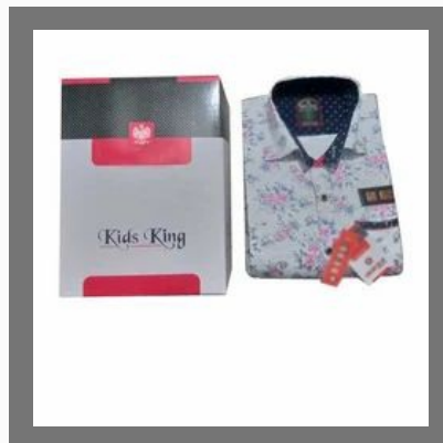
Kids Party Wear Shirt