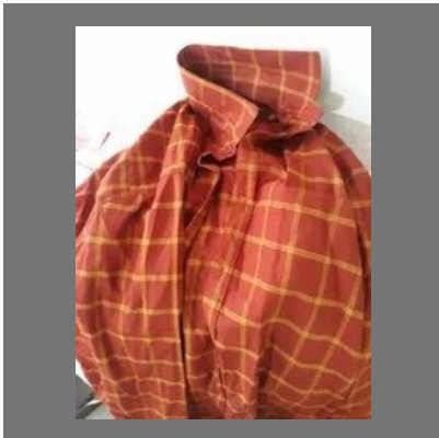
Party Wear Shirts