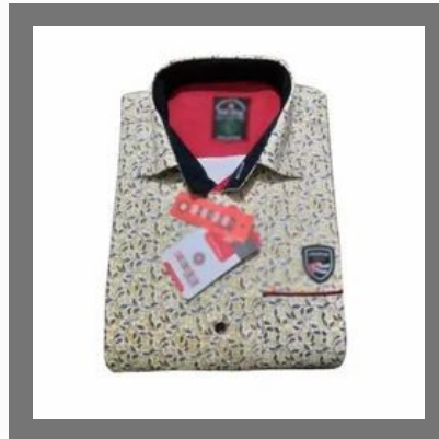
Printed Kids Cotton Shirt