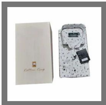
Printed Mens Cotton Shirts