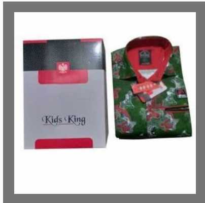
Printed Kids Cotton Shirt