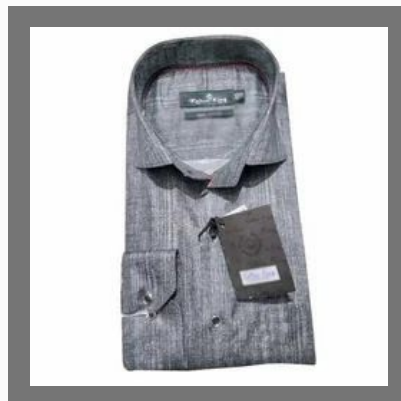
Party Wear Men Shirts