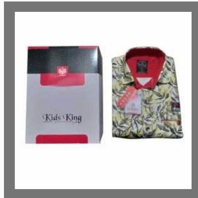
Kids Readymade Shirts