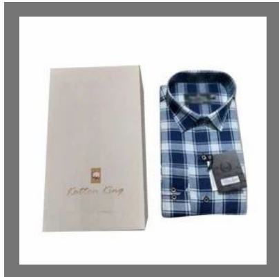
Mens Cotton Shirts