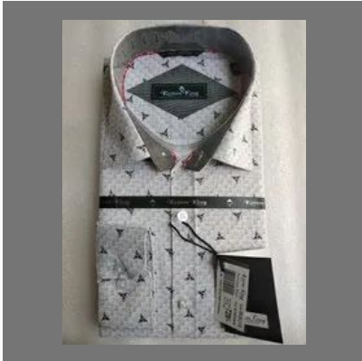
Men's cotton designer shirts