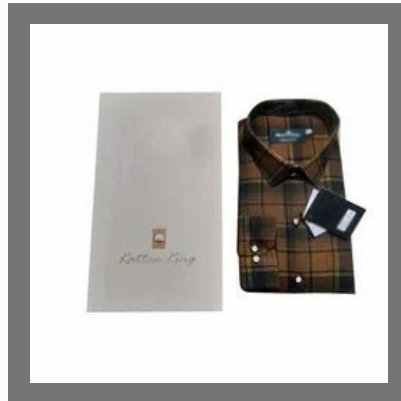
Designer Mens Cotton Shirts