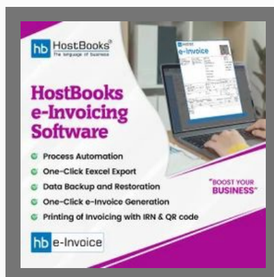
E Invoice Billing Software