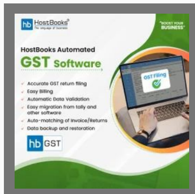
GST Filling Software