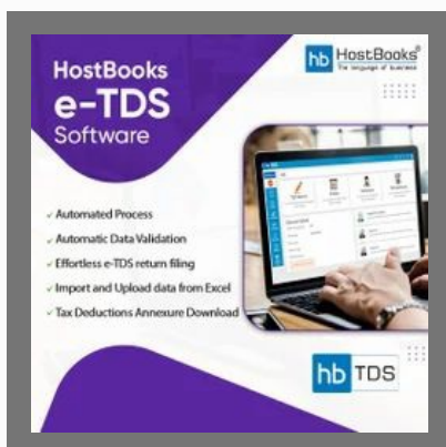
TDS Filing Software