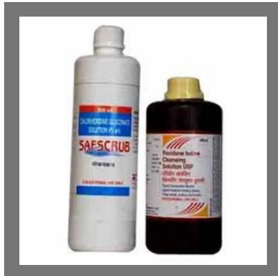
Surgical Scrub Preparation.