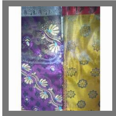
Double Print Silk Saree