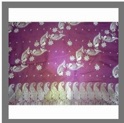
Heavy Work Border Pink Saree