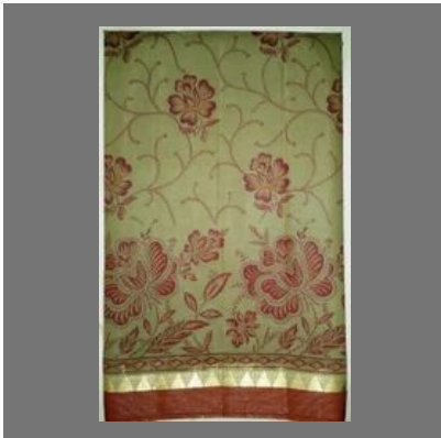
Cotton Printed Saree KF1205