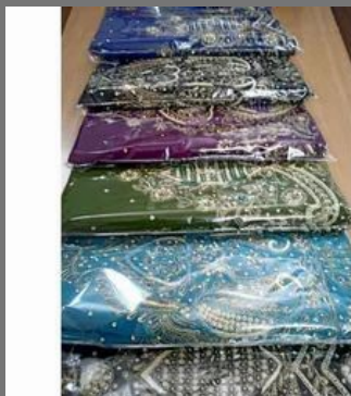
Multi Colour Heavy Work Saree