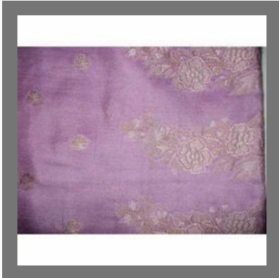
Purple Light Work Saree