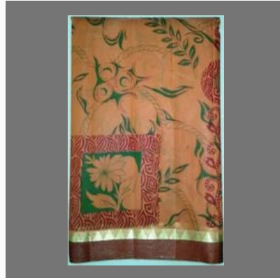
Cotton Printed Saree KF1204