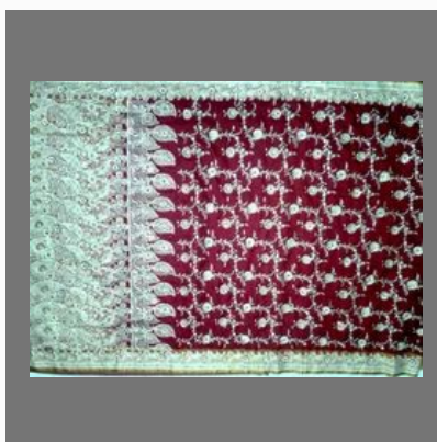
Banarasi Nylon Kf-1110