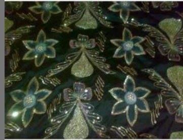
Green Floral Work Saree