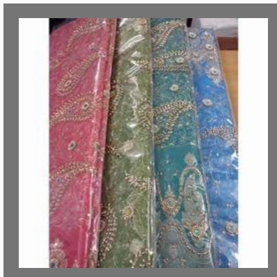
Designer Heavy Work Sarees