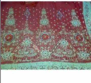
Red Designer Saree