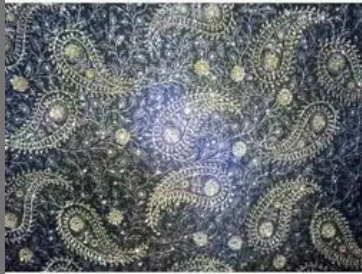
Grey Printed Work Saree