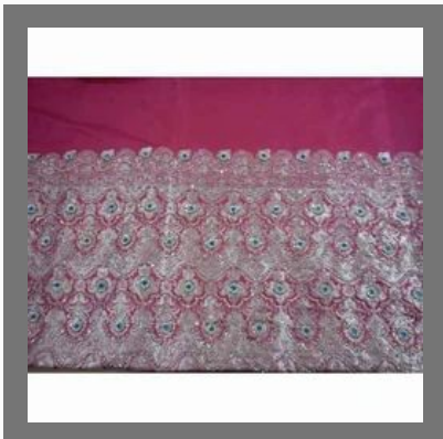
Self Embroided Pink Saree