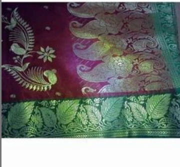
Green Bordered Pink Floral Saree