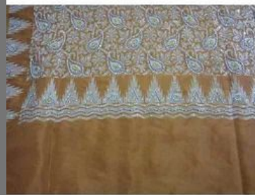
Light Work Brown Saree