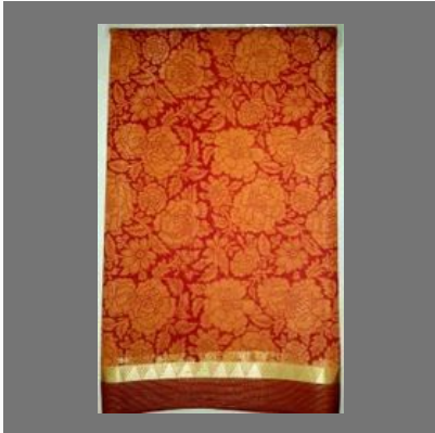
Cotton Printed Saree KF1202