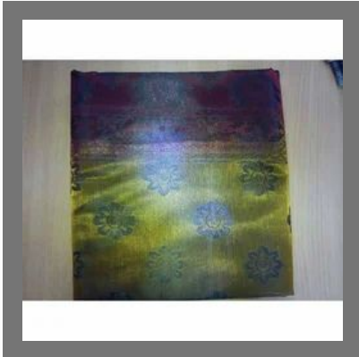
Greenish Printedc Silk Saree