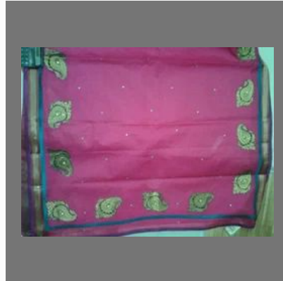
Cotton Patch Work Saree