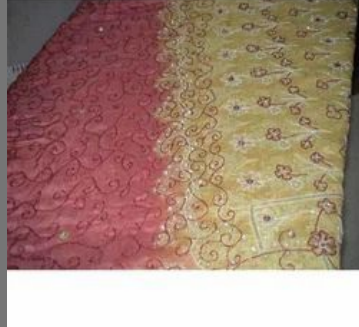
Double Shade Saree