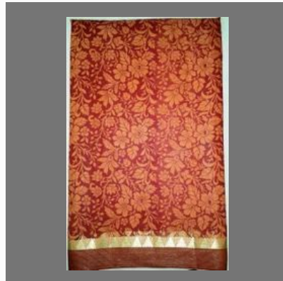
Cotton Printed Saree KF1203