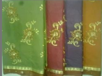
Cotton Embroidered Sarees