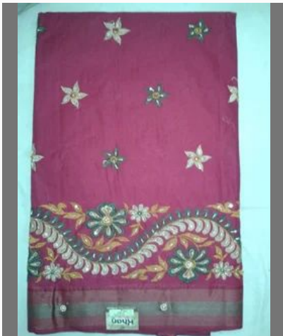
Cotton Embroidered Saree