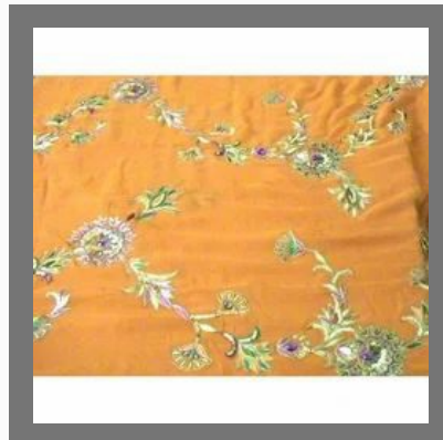
Thread Work Orange Saree