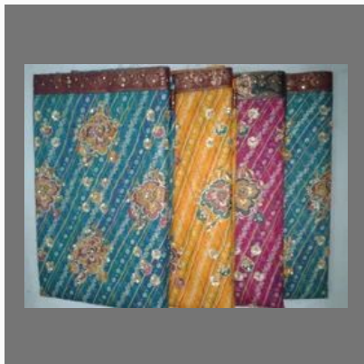
Supernet Chunri Embroidery Saree