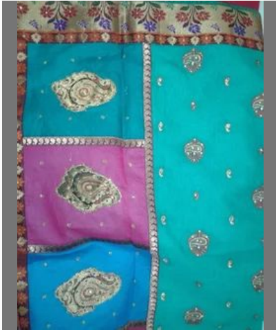
Cotton Patch Work Saree