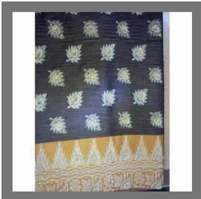
Coloured Designer Saree