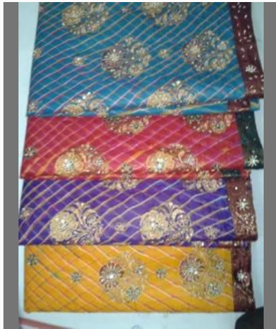
Supernet Chunri Embroidery Saree