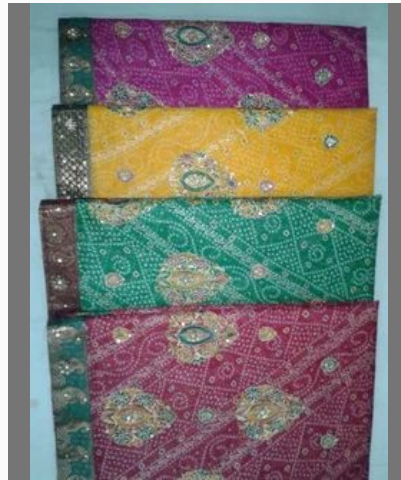
Supernet Chunri Embroidery Saree