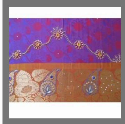
Double Shaded Purple Base Saree