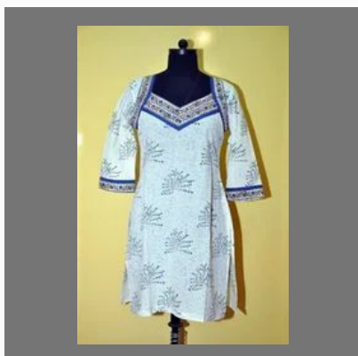
Designer Printed Kurtis