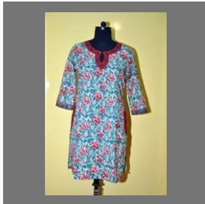
Cotton Fashion Kurtis