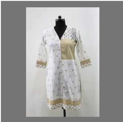
Printed Cotton Kurti