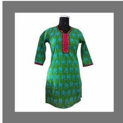
Casual Ladies Kurtis