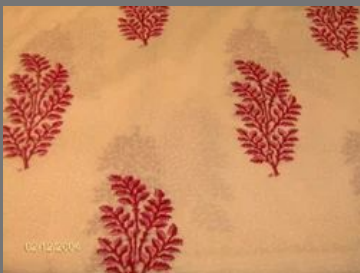
Designer Printed Garments