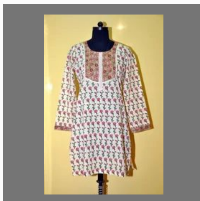
Cotton Printed Kurtis