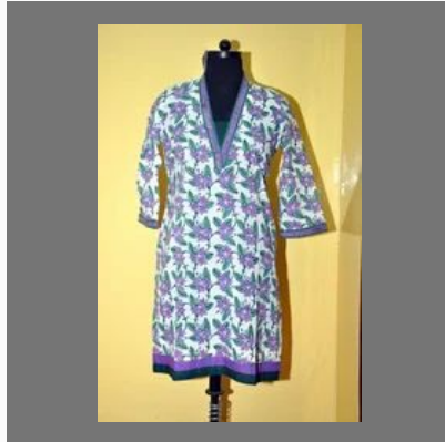
Fashion Cotton Kurtis