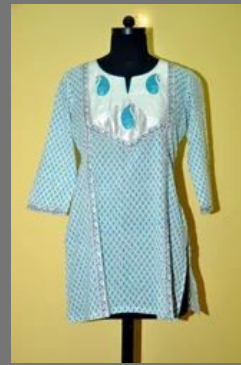
Ladies Cotton Kurta