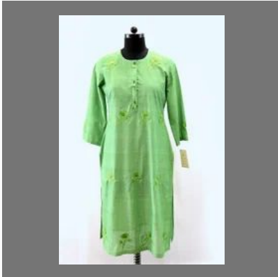
Ladies Casual Wear