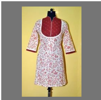
Ladies Designer Kurtis