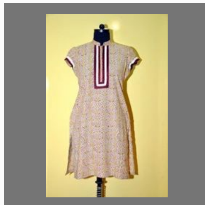
Printed Ladies Kurta