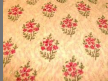
Hand Block Printed