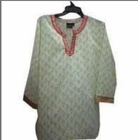
Full Sleeve Ladies Kurti