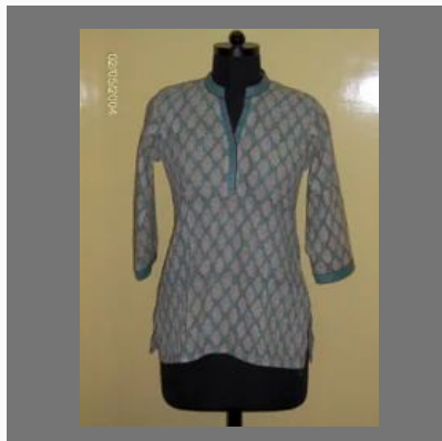
Designer Cotton Kurtis