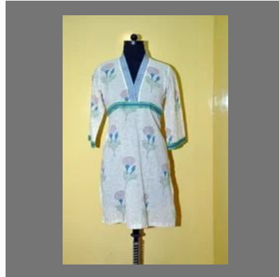
Printed Designer Kurtis