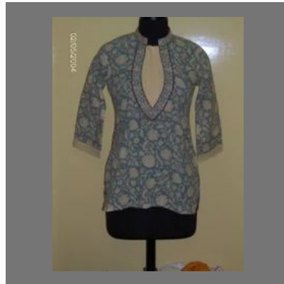
Cotton Ladies Kurta