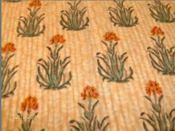
Cotton Printed Garments