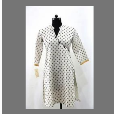
Painted Ladies Kurtis