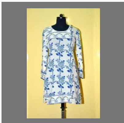
Ladies Designer Kurta