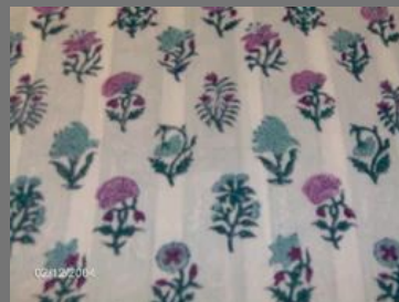
Block Printed Garments