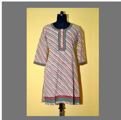
Ladies Cotton Kurtis