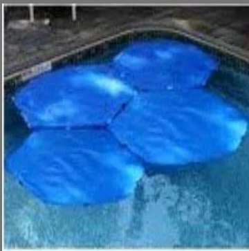
Hexavalent and Trivalent Yellow Passivation Chemical