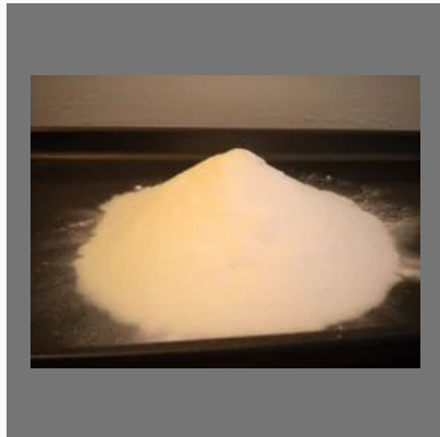
Alkaline Copper Salt