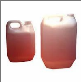
Black Passivation Chemical