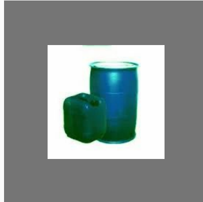
Alkaline Copper Plating Chemical