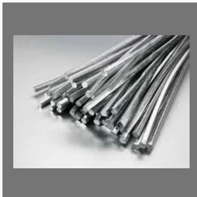
Stanux TIN Anti Tarnish Chemical (By Immersion)