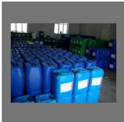
Aluminum Electroplating Chemical