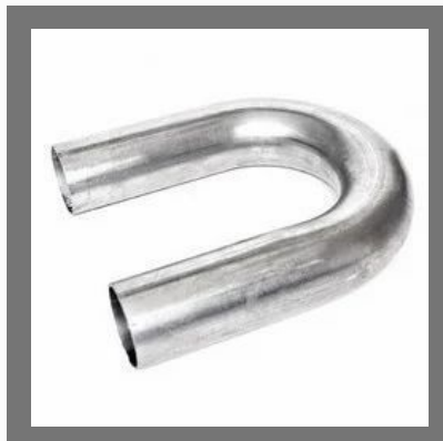
Nickel Stripper Chemical (By Immersion Process)