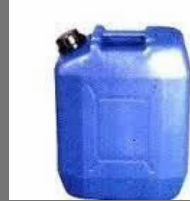
Hexavalent and Trivalent Blue Passivation Chemical