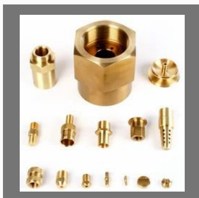
Brass Anti Tarnish Chemical (By Immersion)