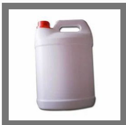
Water Base Lacquer