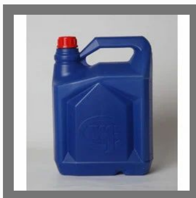
Solvent Base Lacquer