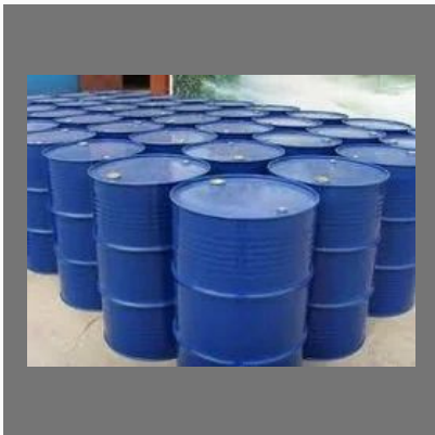
Nickel Plating Chemical