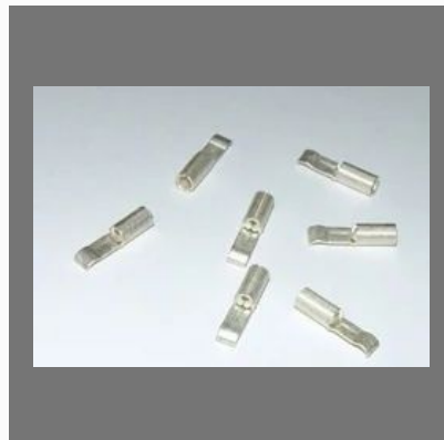
Silver Anti Tarnish Chemical (By Electrolysis)