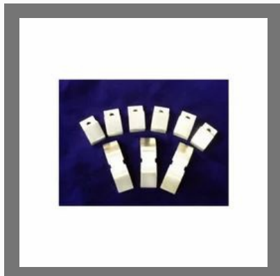
Silver Anti Tarnish Chemical (By Immersion)