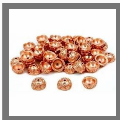
Copper Anti Tarnish Chemical (By Immersion)