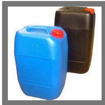
Zinc Plating Chemical