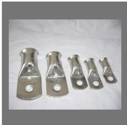
Stanux Tin Stripper Chemical