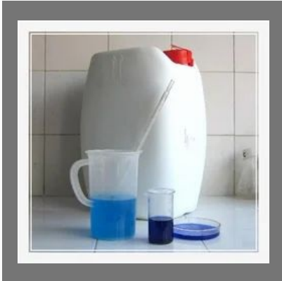
Tin Plating Chemical