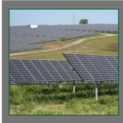
Ground-Based Solar Plants