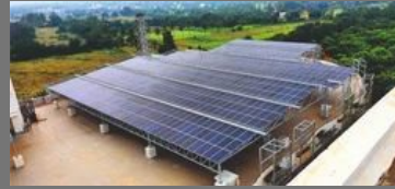
RCC roof with Elevated Structure Rooftop