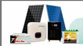
On-Grid & Off-Grid Solar Combos