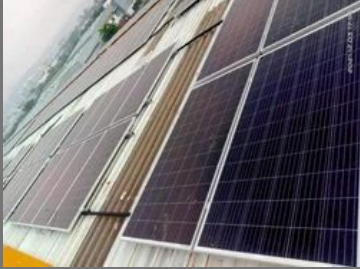
Rooftop + Ground Mounted + Single Axis Tracker