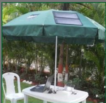
CIGS Flexible Thin-Film PV Applications