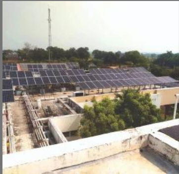
GI Industrial Rooftop