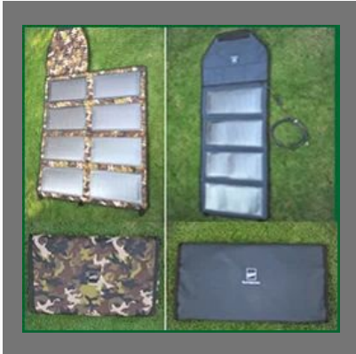
Solar PV Blanket