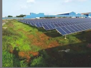
Ground Mounted Solar Power Plant