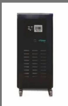
Off Grid Inverter