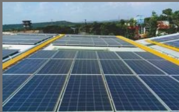
Tin Shed Rooftop