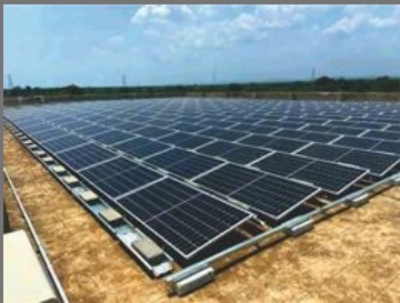
RCC Roof (Ballast Type non penetrative structure) Rooftop