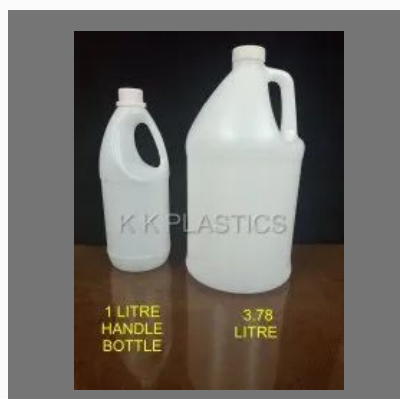
1L and 3.78L HDPE Bottles