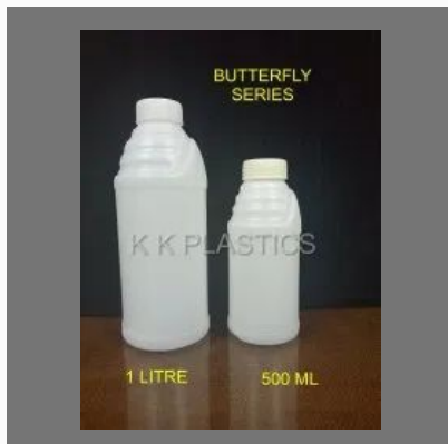
Butterfly Shaped Hdpe Bottles