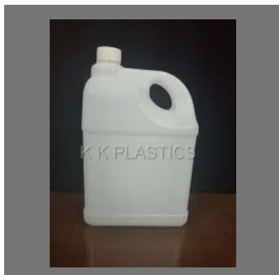
Round Seal Cap Plastic Jerry Can