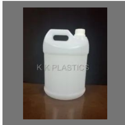
5L Half Round Shape Jerry Can