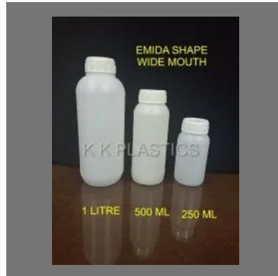
Hdpe Emida Shape Bottle