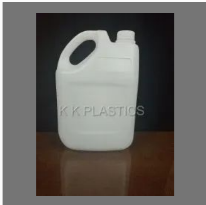
5L Plastic Jerry Can