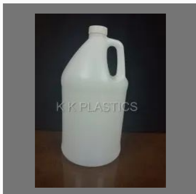
Gallon Plastic Bottles