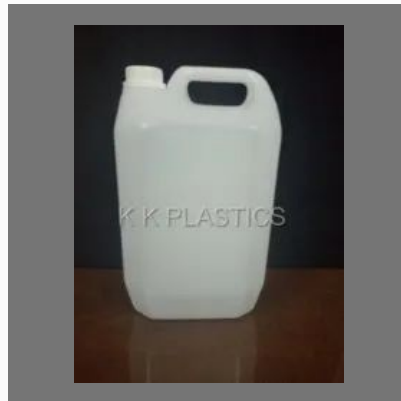
Plastic White Jerry Can