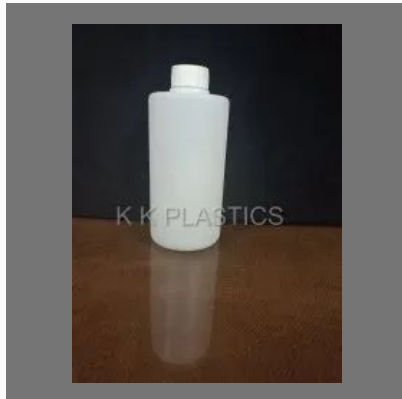
1 Lt Hdpe Bottle