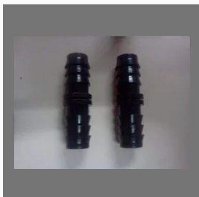
Plastic Drip Irrigation Fitting