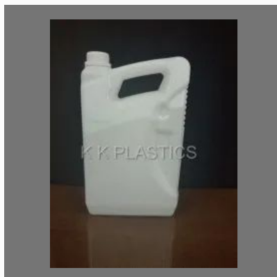
5l Hdpe Jerry Can