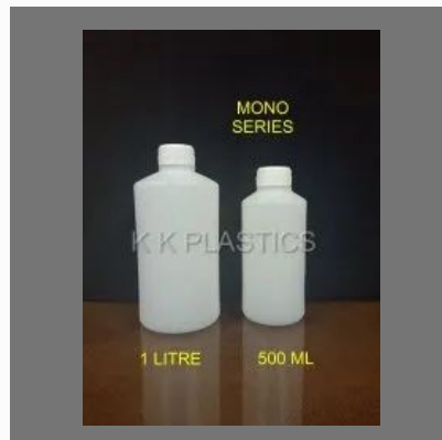
Hdpe Plastic Round Bottle