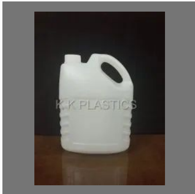
5 Liter White Plastic Can