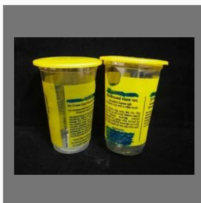
Fruit Fly Trap