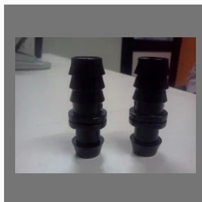
Lateral Drip Fittings