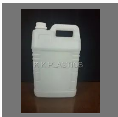
5 Litre Hdpe Plastic Can