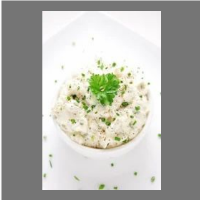
Garlic Cream Cheese