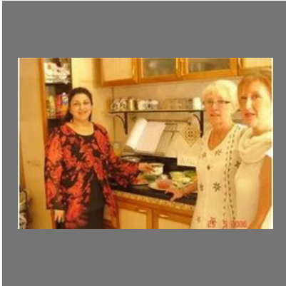
Travel Agents Tie-Up