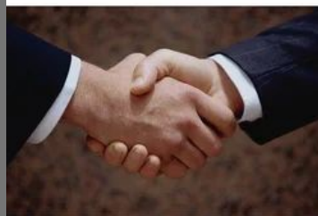
Drafting Of Various Contracts, Agreements