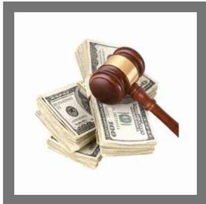
Registration under Various Tax Laws