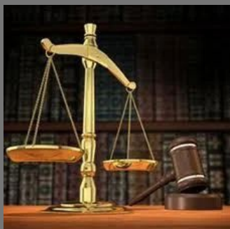
Labour Law Services