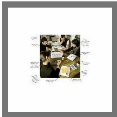
Licenses/ Approval Under Various Laws