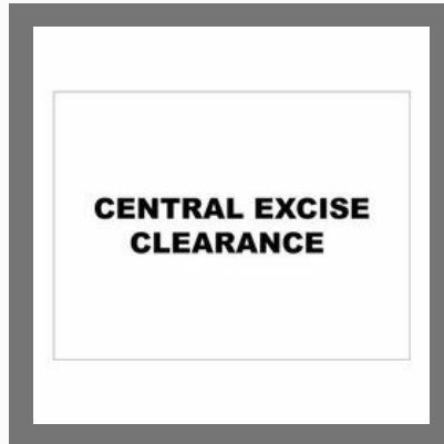
Certified Filing Centre Under Central Excise And Service Tax