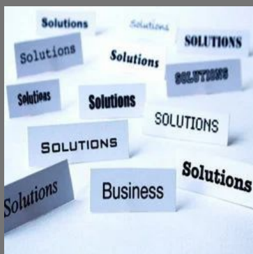
Complete Business Solution