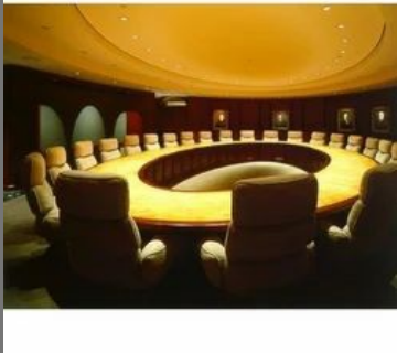
Consultation on Board and General Meetings