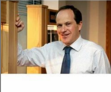
Amalgamation / Merger Services