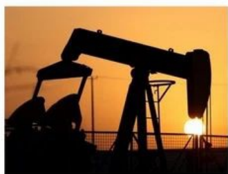
Setting Up Branch Offices In India By Foreign Companies.