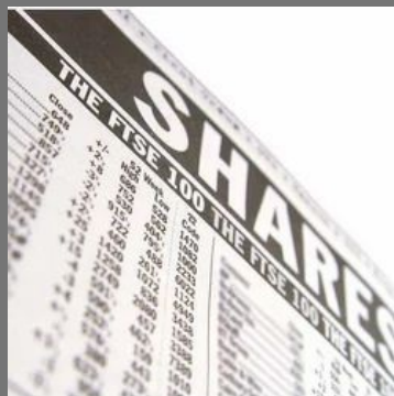
External Commercial Borrowings And Transfer Of Shares And / Or Securities.