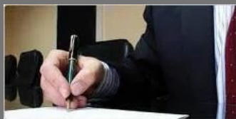
Conveyancing & Drafting