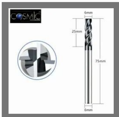
6mm 45 HRC END MILLS