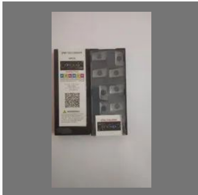
Apmt 1604 Milling Insert