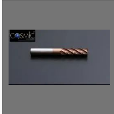
10mm Solid Carbide End Mills