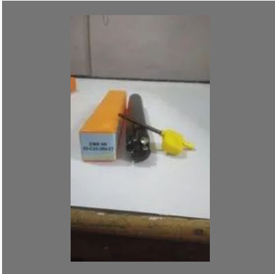
200 MM RPMT 1204 Index Able End Mill