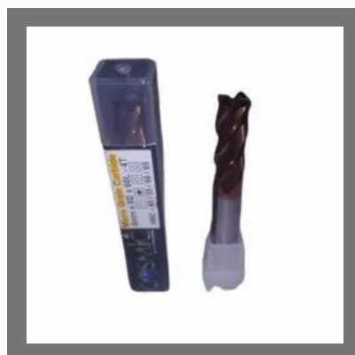
8mm 55 HRC Carbide End Mills