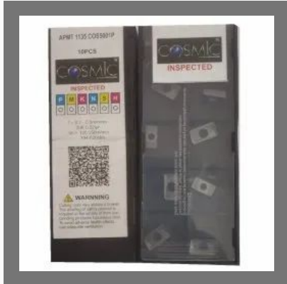
Apmt 1135 Milling Inserts