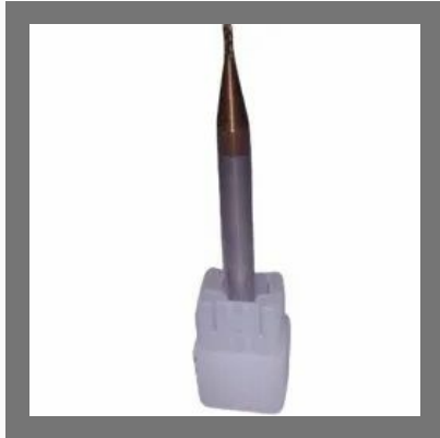
2mm ENDMILL 55HRC