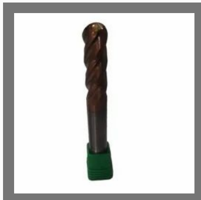
12mm Ball Nose