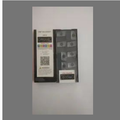
VMC Cutting Tools