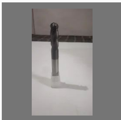
12mm 45 HRC Ballnose