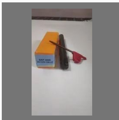
Apmc 1604 Indexable Endmill