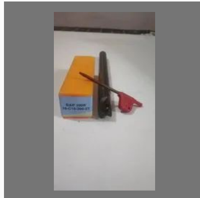
200 MM APMT 1135 INDEX ABLE END MILL