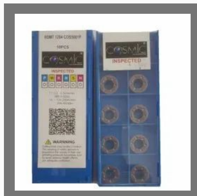
Cosmic RDMT 1204 Milling Inserts