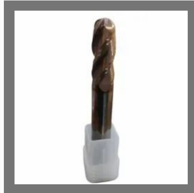
10mm Ball Nose