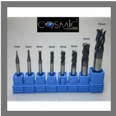
Solid Carbide Tools