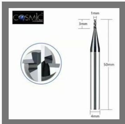
45 HRC 1mm End Mills