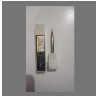
1mm Solid Carbide Endmill