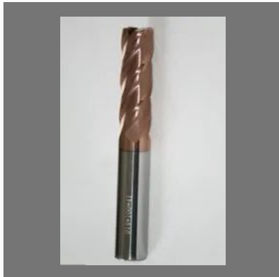
14mm Carbide End Mills